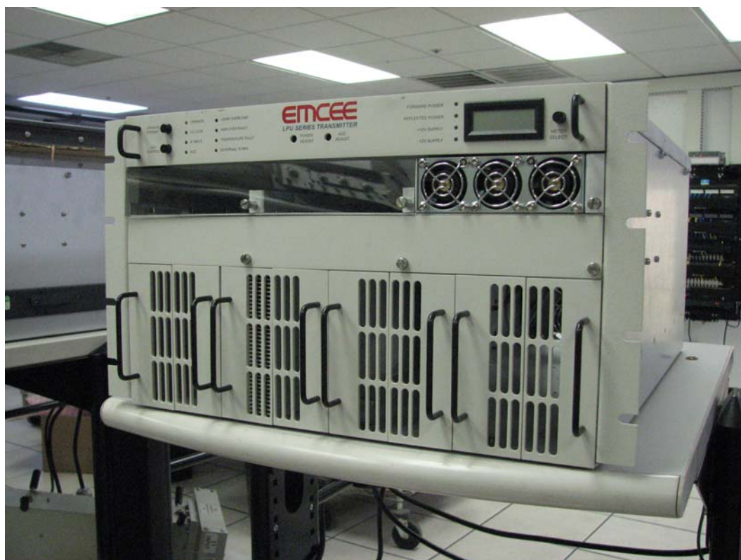
HSD-1250 Front View