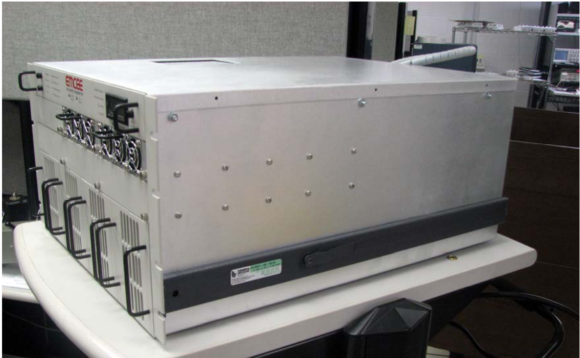
LPU-300 Side View