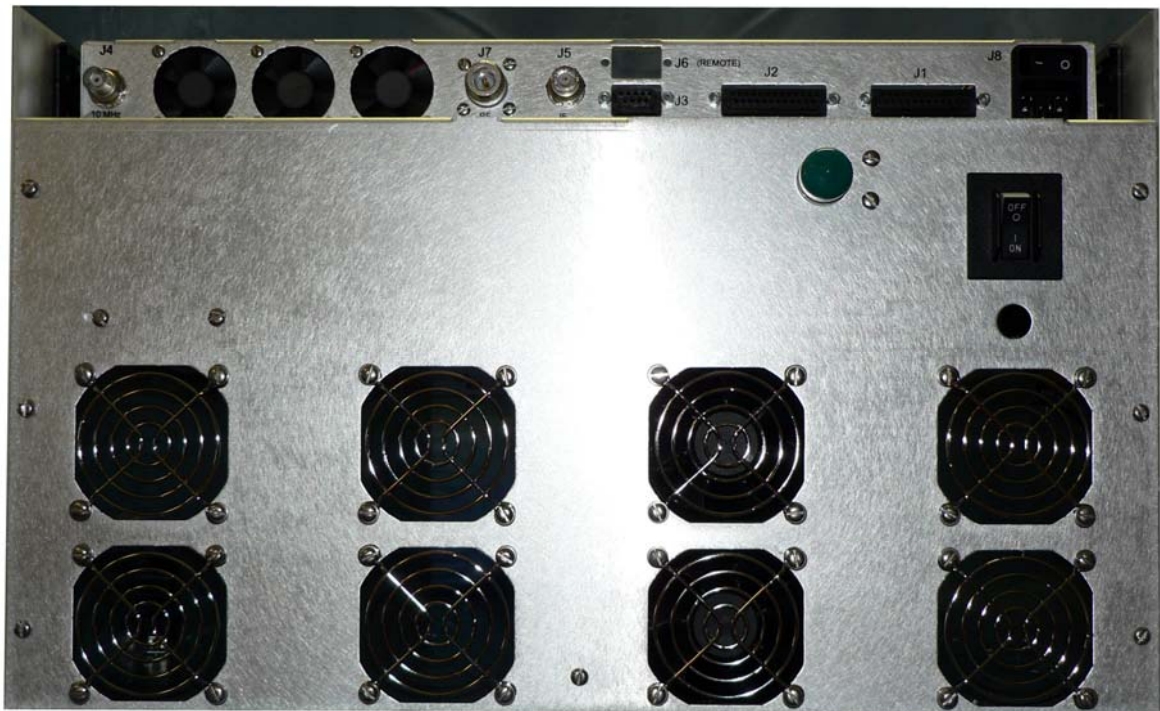
HSD-2500 Rear View