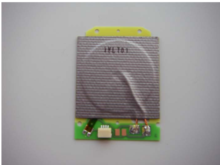
Primary Coil Side B