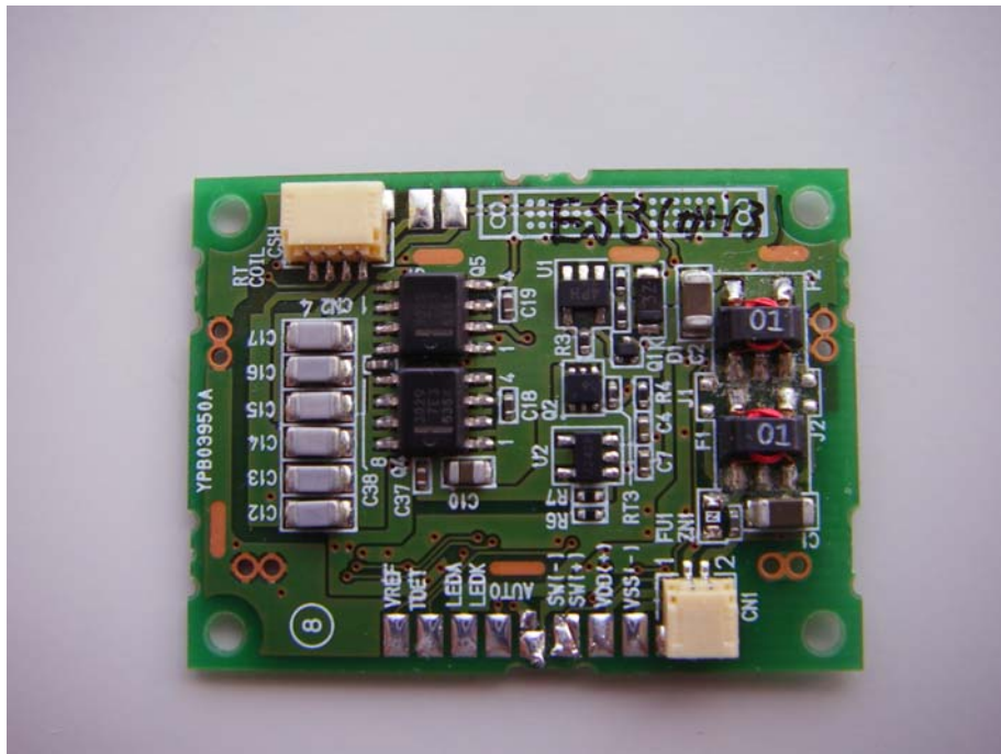
Module Side B without Shield