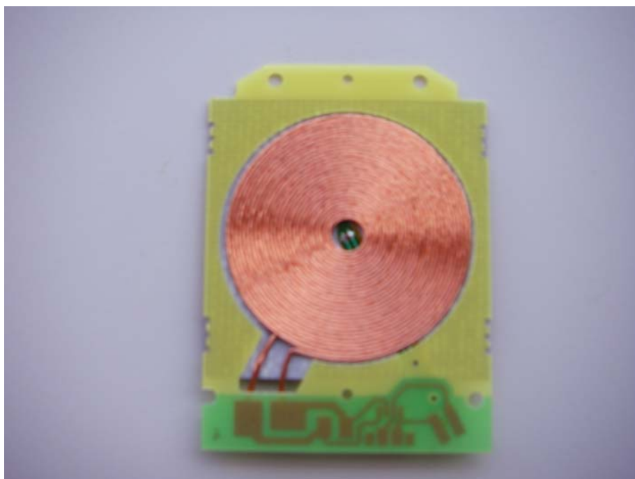
Primary Coil Side A