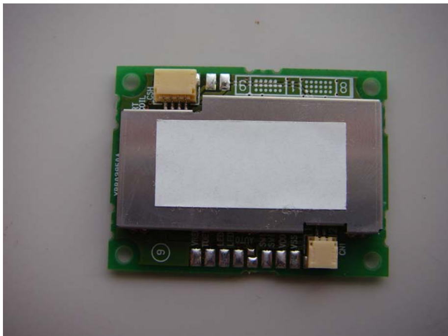
Module Side B with Shield