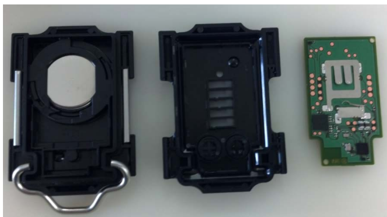
Circuit board Back