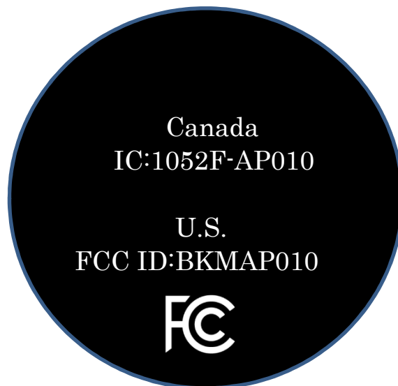
Surface of the body (E_Label)