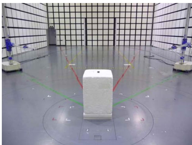
(rear, below 1GHz)