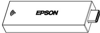
STI6110-D101 (RoHS) Streaming Media Player