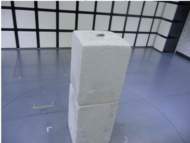
Front (above 1GHz)