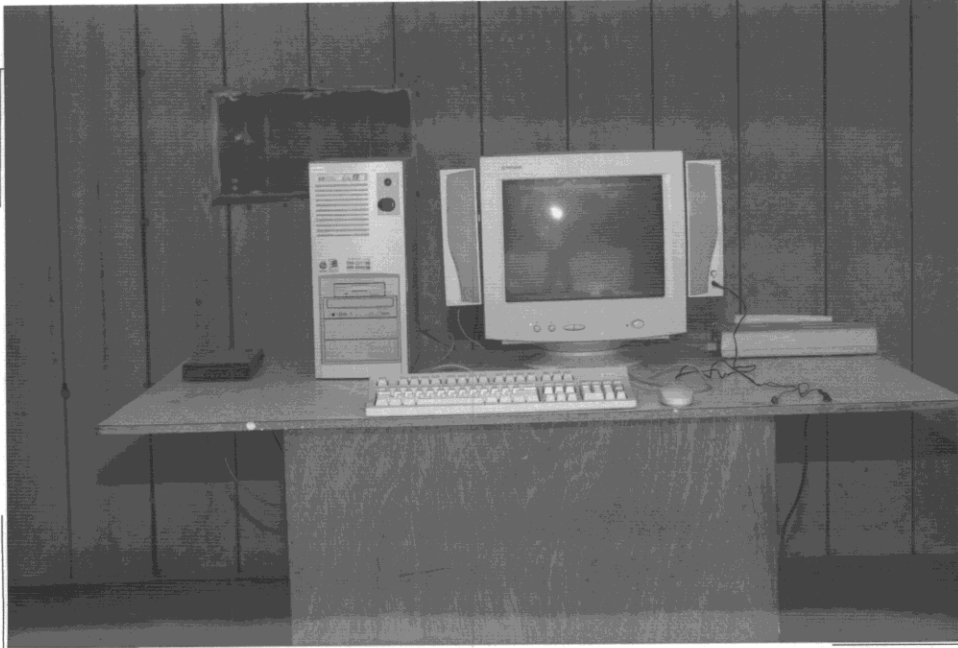
Front View of Radiated Measurement