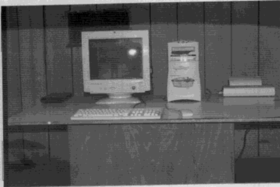
Front View of Radiated Measurement