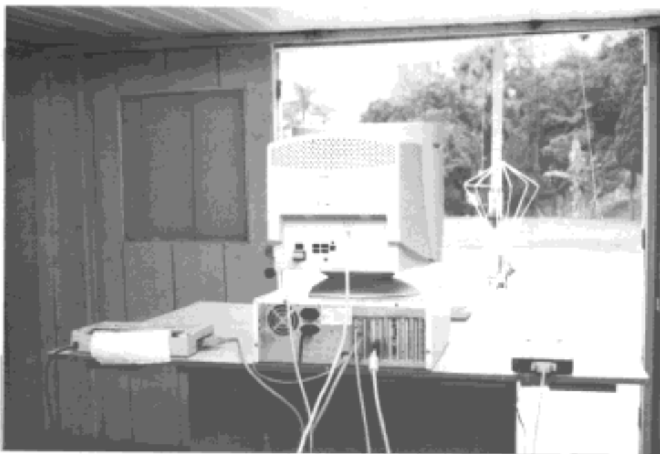
Back View of Radiated Measurement