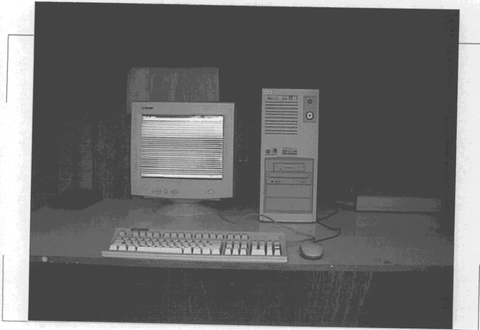
Front View of Radiated Measurement