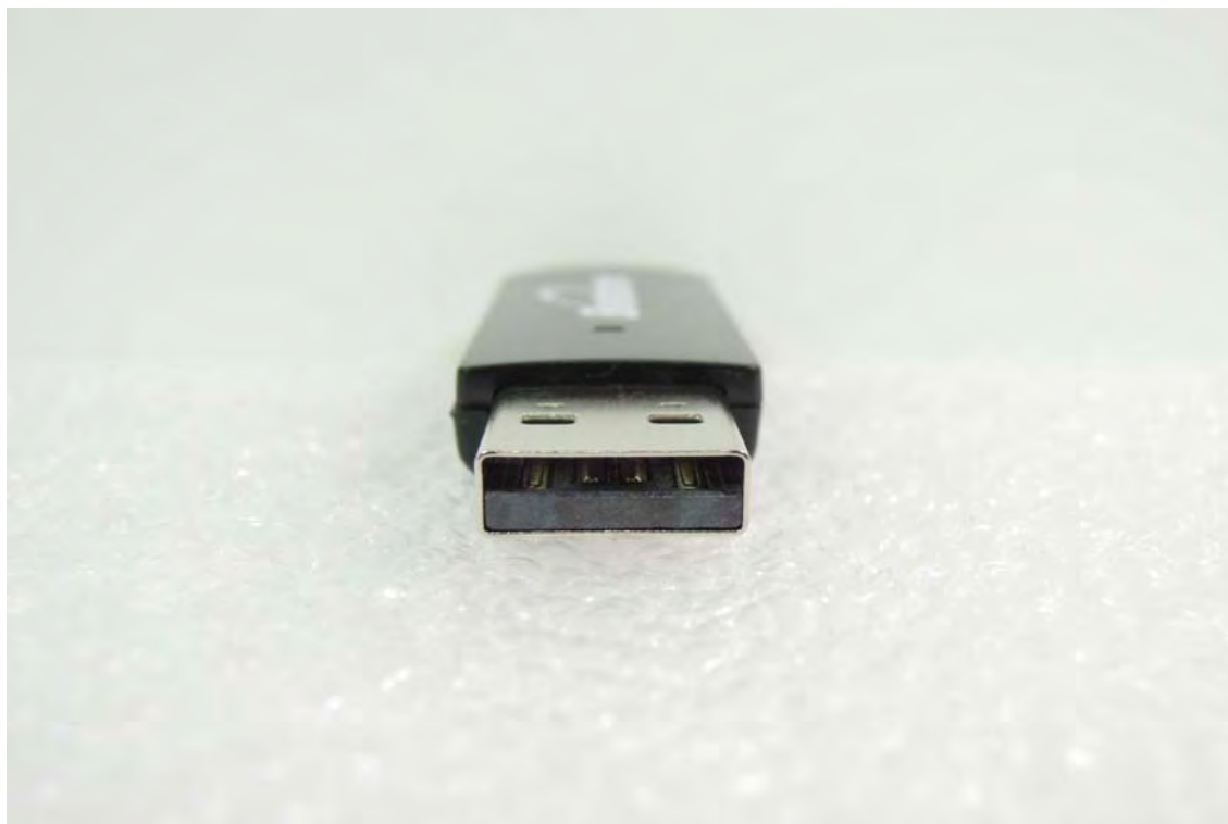
Side View of EUT – 2