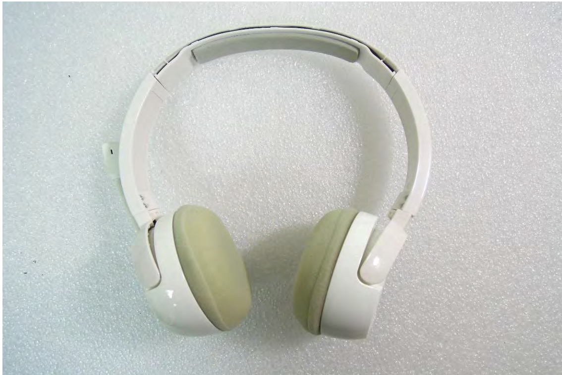
Side View of EUT - 1