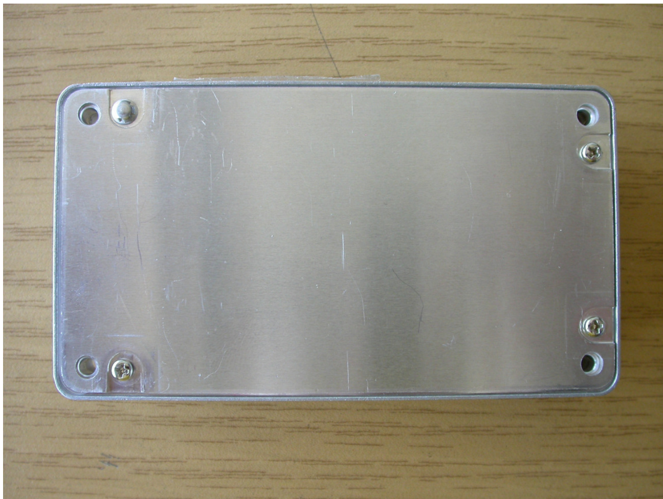
Rear view of the EUT