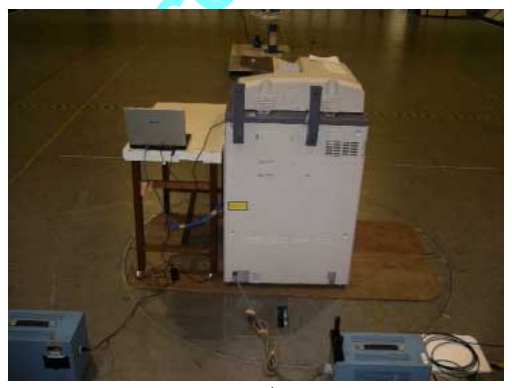
- Rear View -