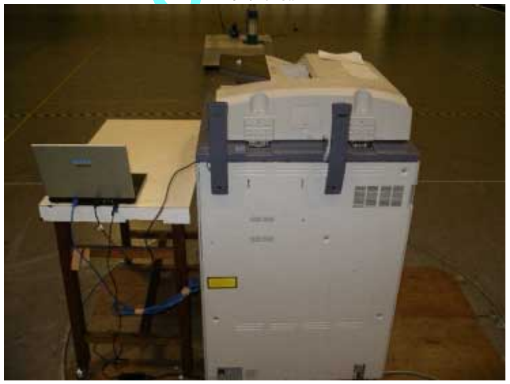
- Rear View -