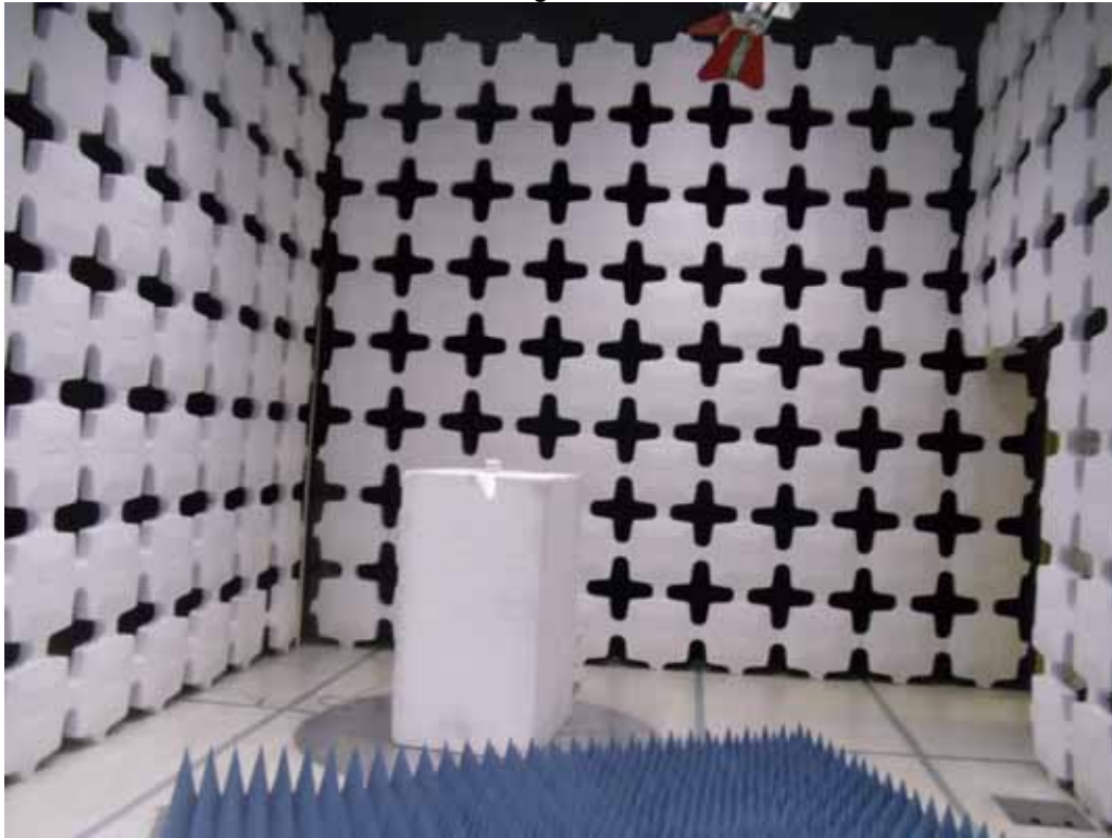
Test Setup for Radiated Emissions, Above 1GHz – Horizontal Polarization