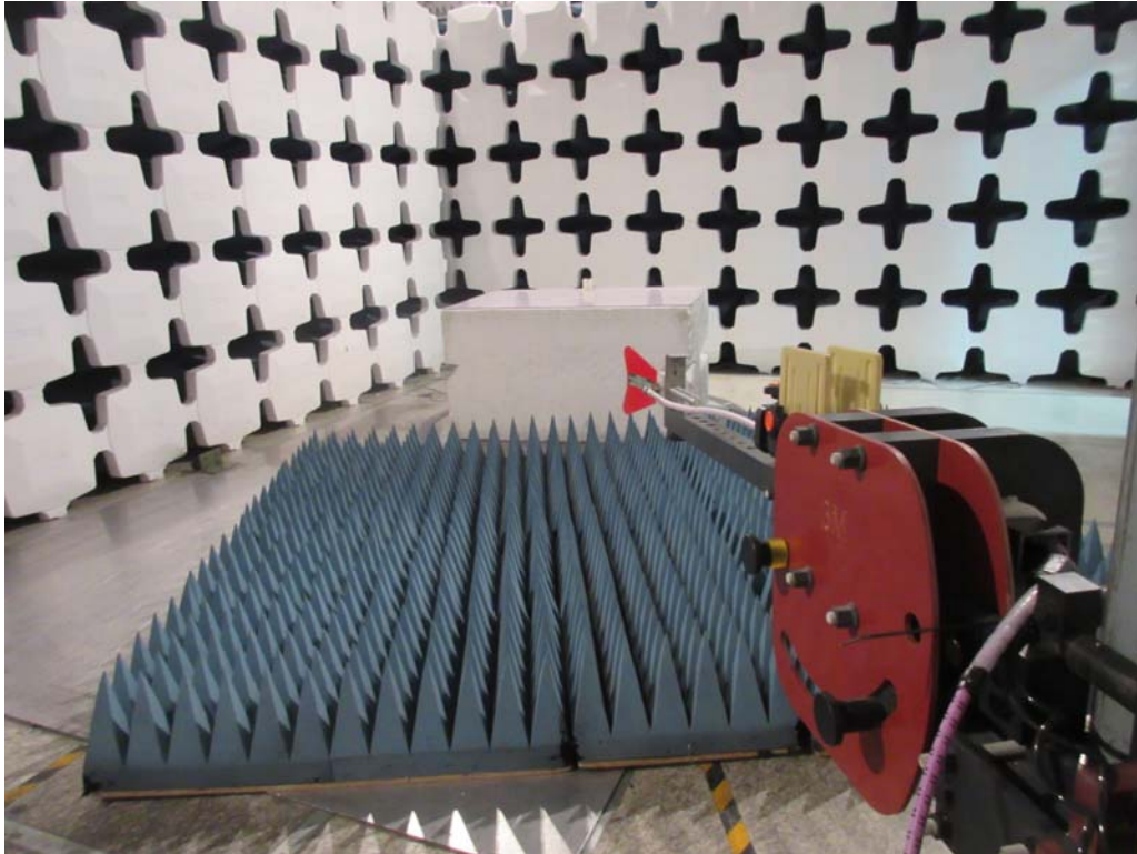
Test Setup for Radiated Emissions, 1 to 4.5GHz – Horizontal Polarization