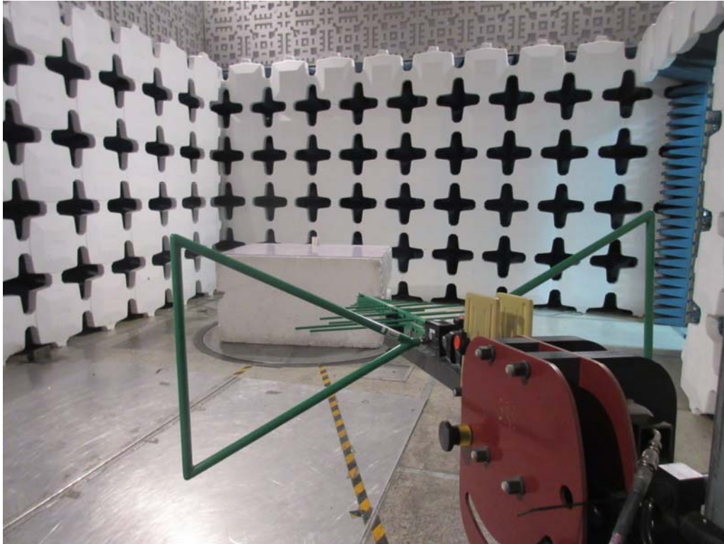
Test Setup for Radiated Emissions, 30MHz to 1GHz – Horizontal Polarization