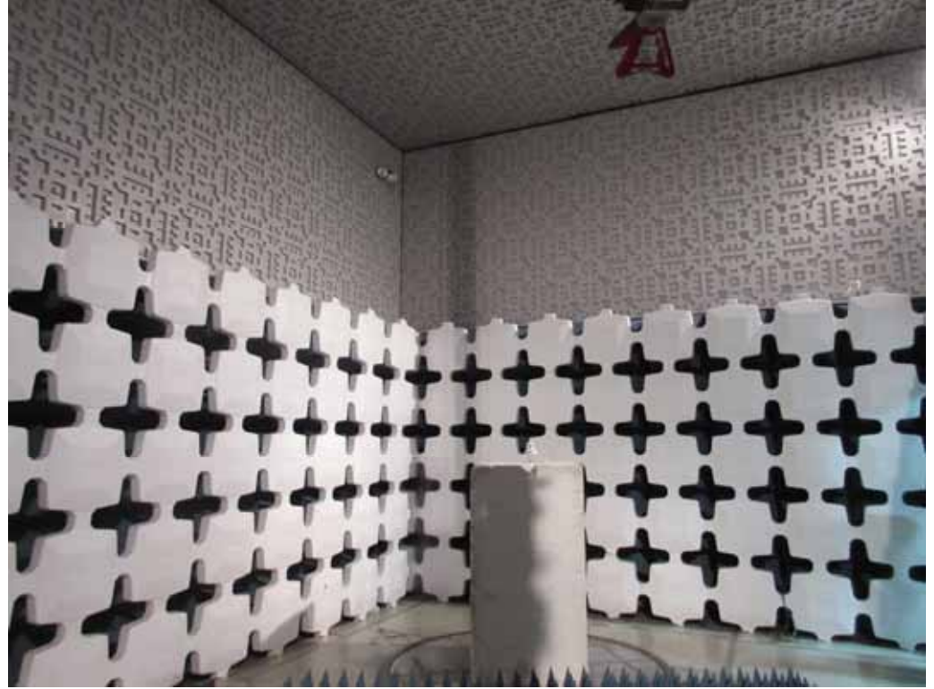
Test Setup for Radiated Emissions, 1 to 10GHz – Vertical Polarization

Test Setup for Radiated Emissions, 1 to 10GHz – Horizontal Polarization