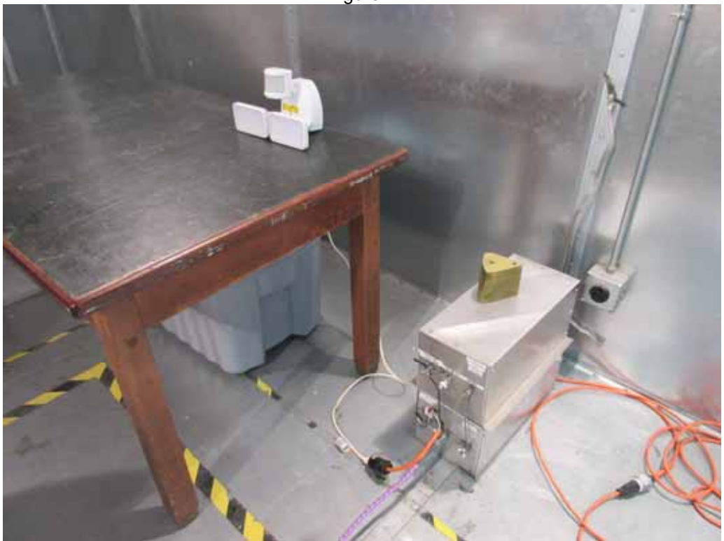
Test Setup for Conducted Emissions