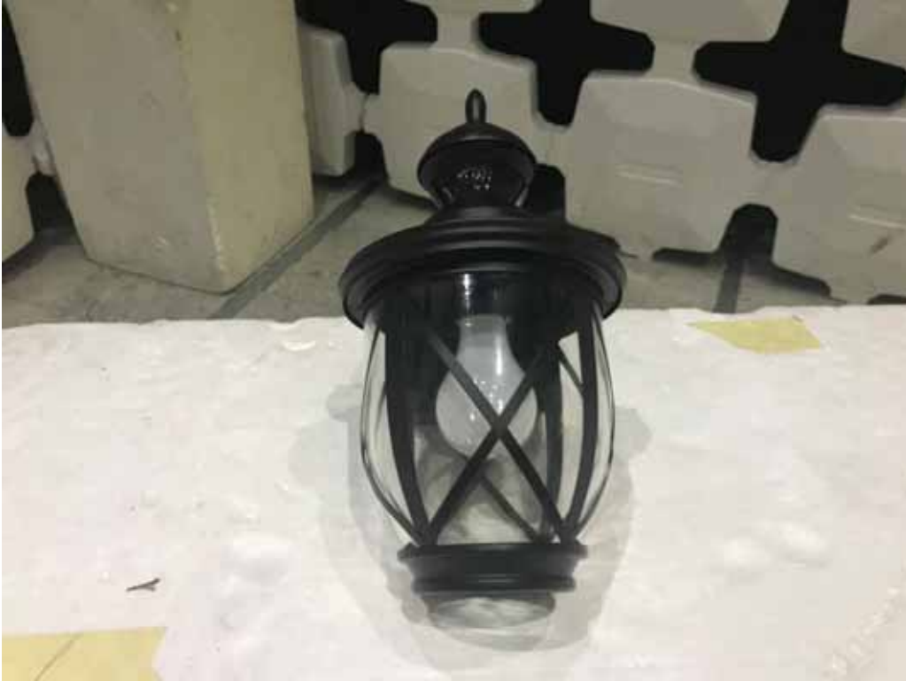
Photograph of EUT