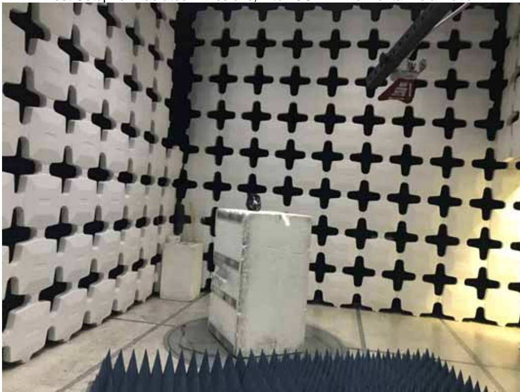
Test Setup for Radiated Emissions, 1 to 10GHz – Vertical Polarization