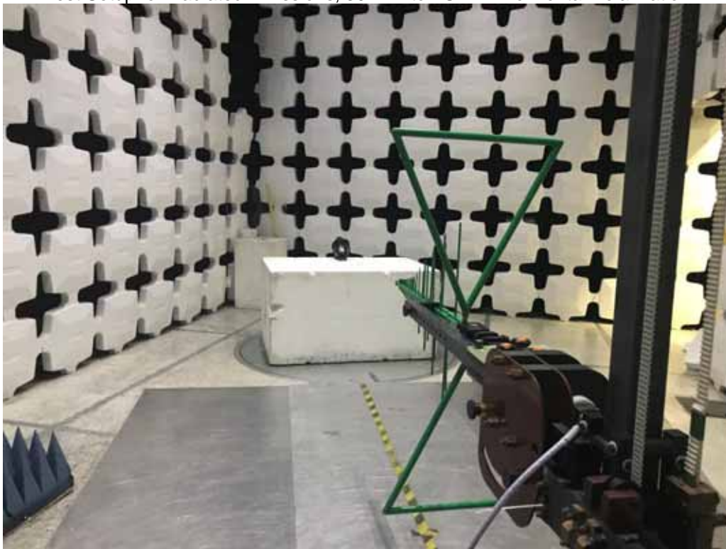
Test Setup for Radiated Emissions, 30MHz to 1GHz – Vertical Polarization