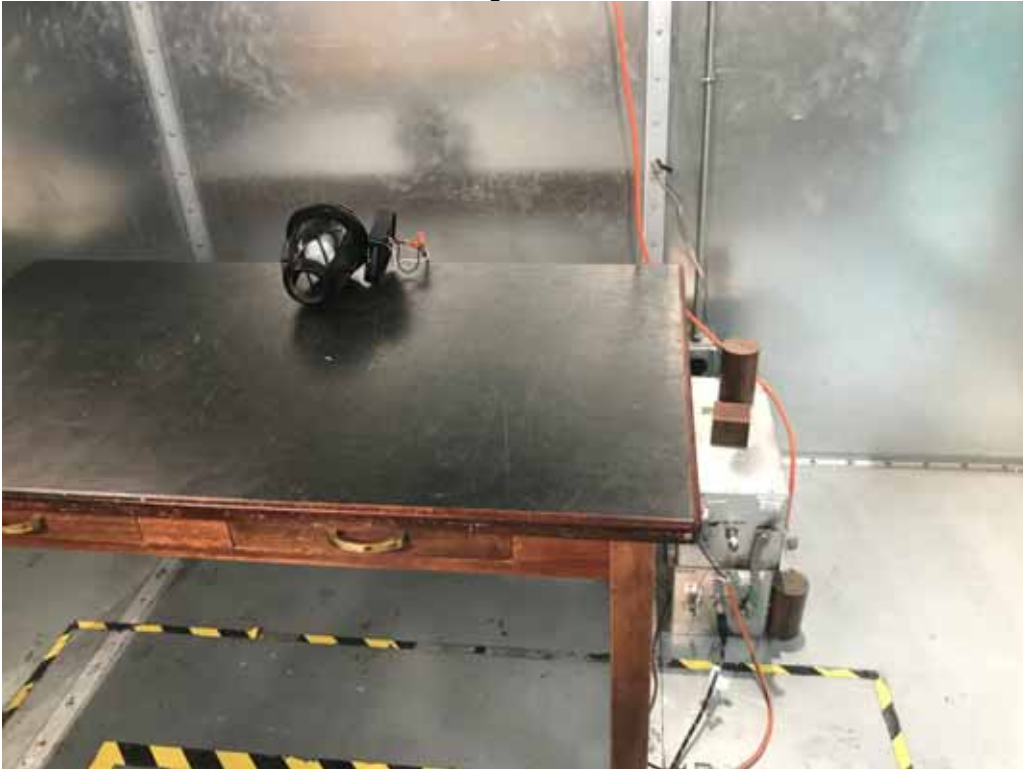
Test Setup for Conducted Emissions