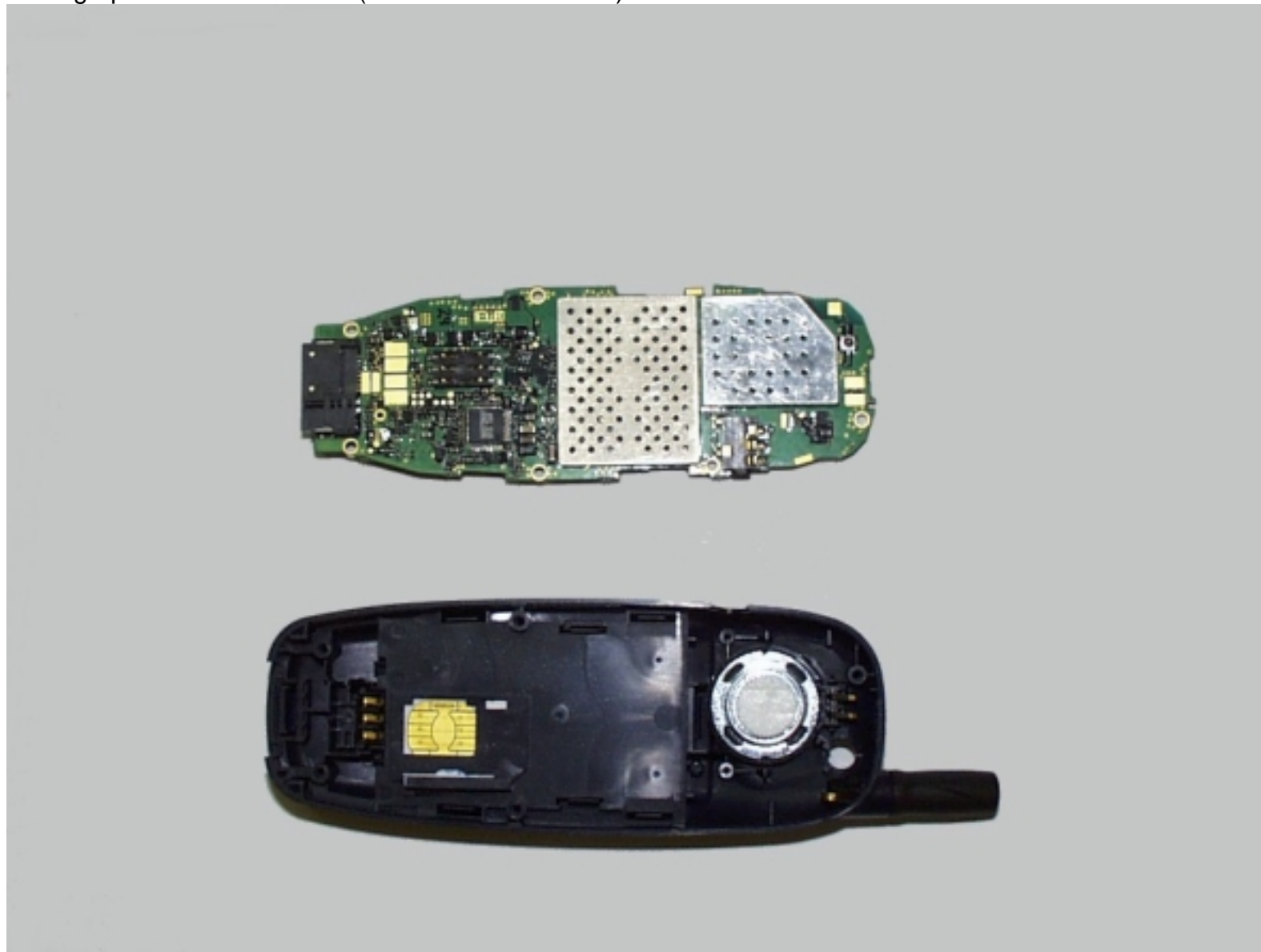
Photograph 1 MT289XG01A (Back Cover Removed)