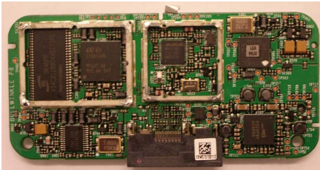
Rear face with shields removed