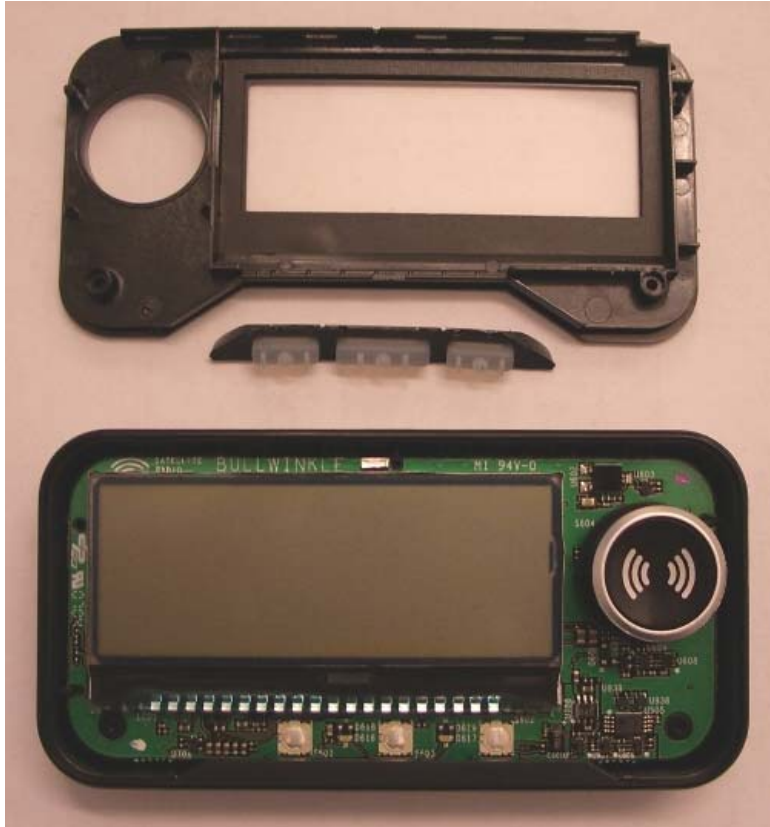
Open Case with PCB inside