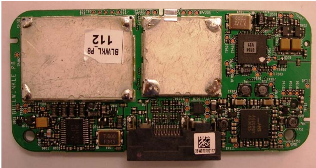
Rear face with shields on