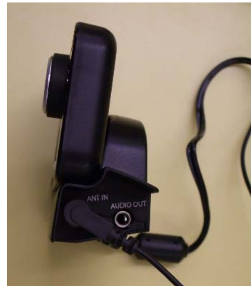
XM Antenna Input