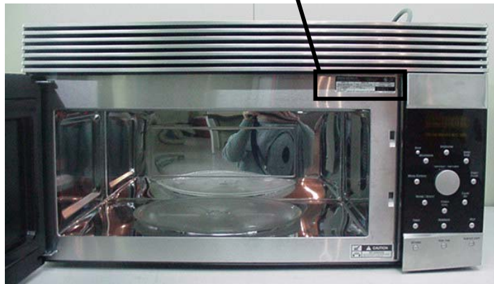
< Fig. 2. Photo of the physical location of the label>

* Alternate location: The nameplate may be alternatively affixed on the left side of control panel or internal surface of oven cavity or rear surface of oven.