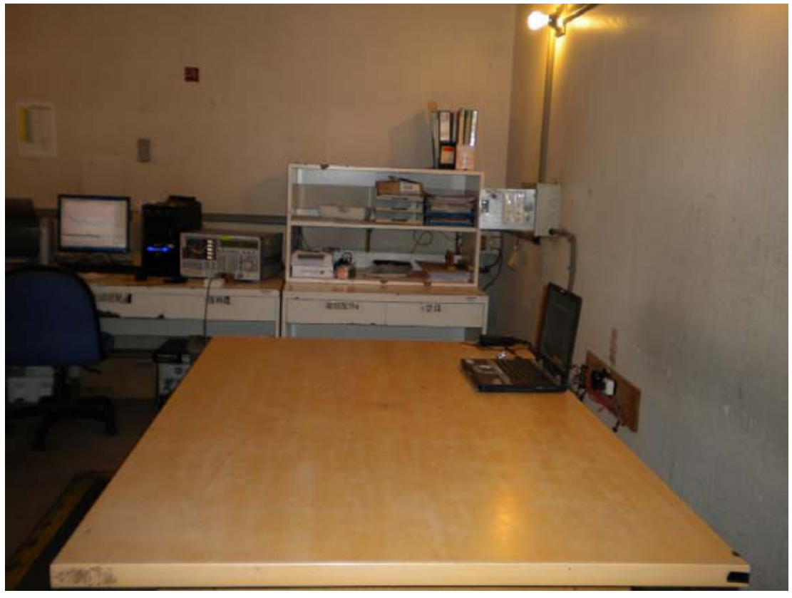
BACK VIEW OF CONDUCTED MEASUREMENT