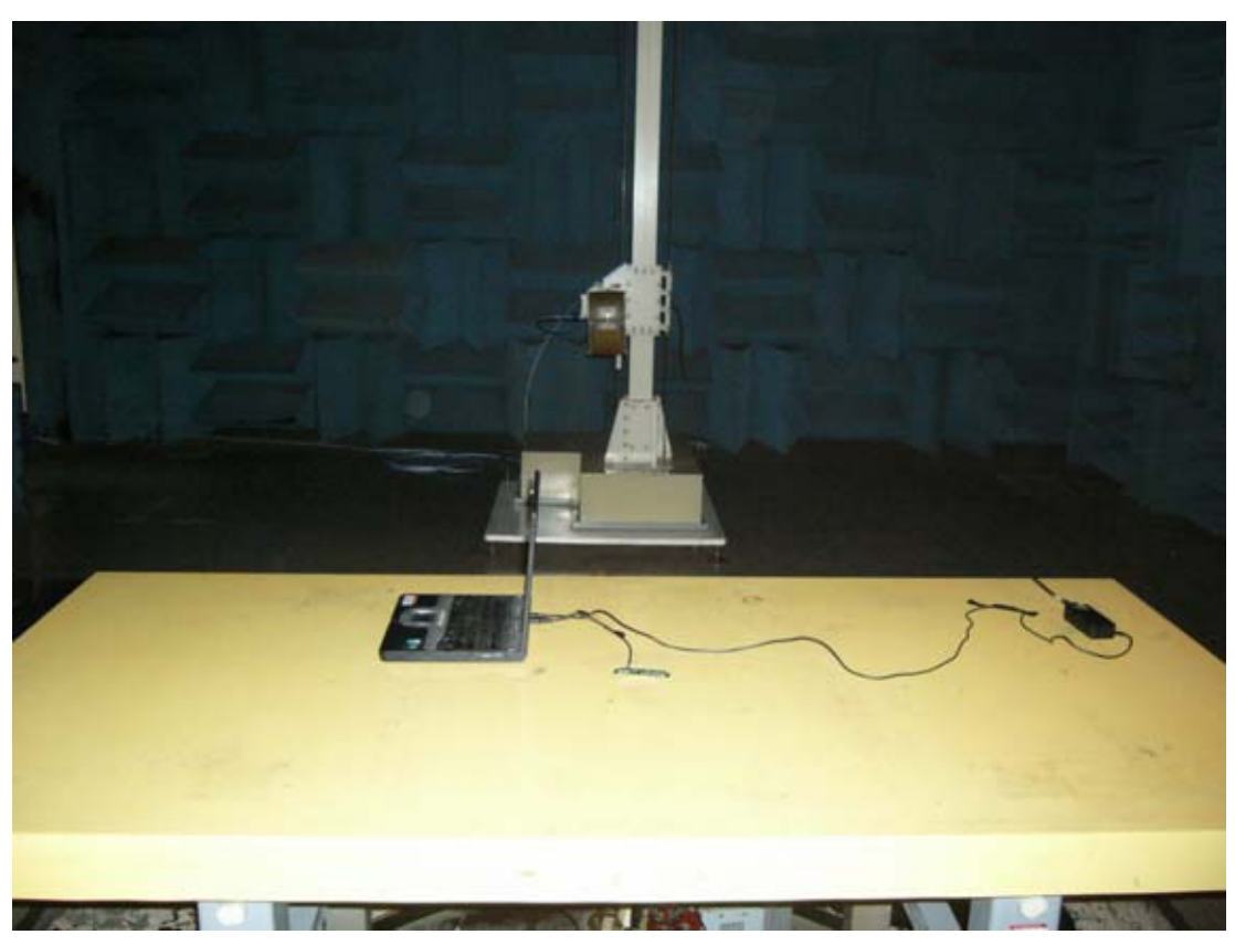
BACK VIEW OF RADIATED MEASUREMENT