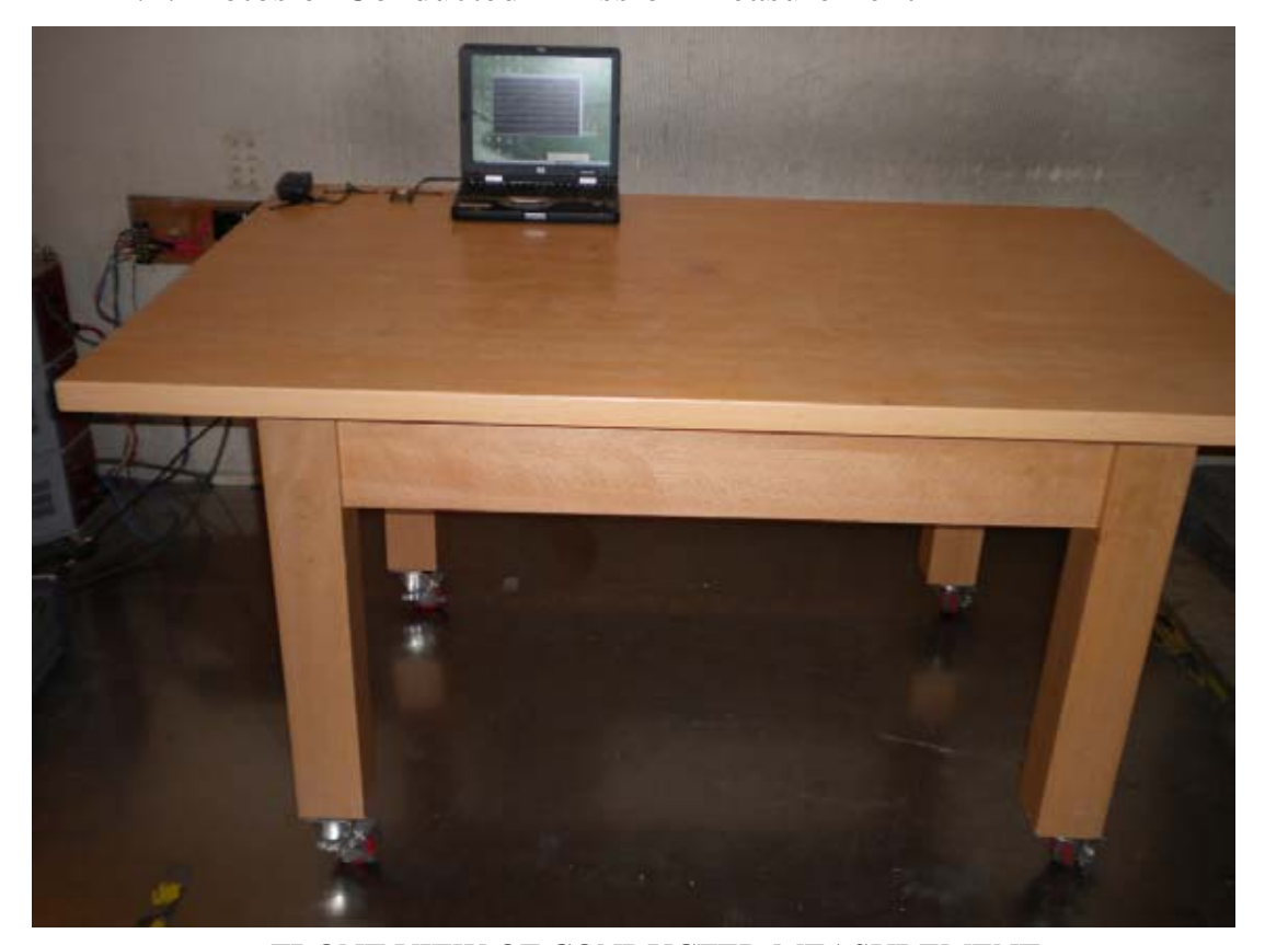
FRONT VIEW OF CONDUCTED MEASUREMENT