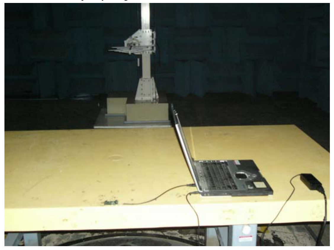
11.2.2. Frequency Above 1GHz

11.2.Photos of Radiated Measurement at Semi-Anechoic Chamber 11.2.1. Frequency Range 30MHz~1GHz