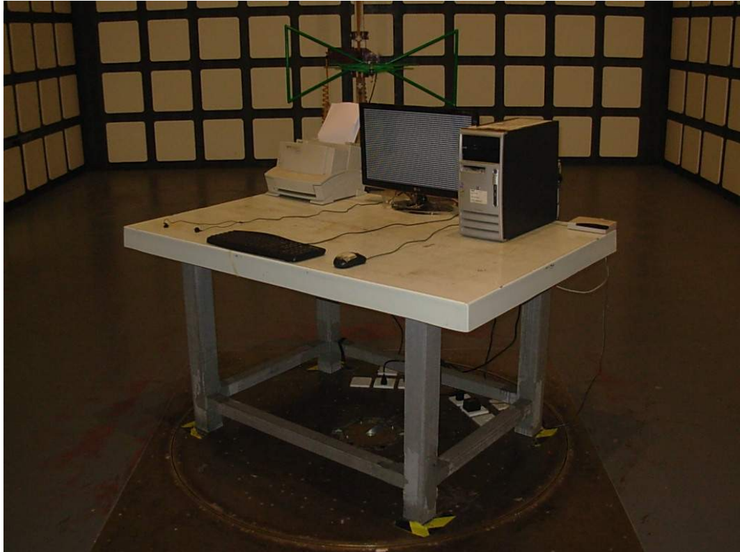
SETUP WITH MAXIMUM DETECTED EMISSION AT HORIZONTAL POLARIZATION (DVI 1920*1080@60Hz)