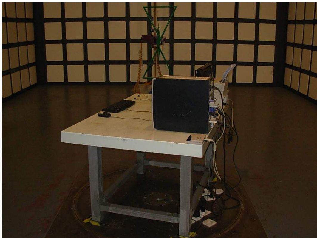
SETUP WITH MAXIMUM DETECTED EMISSION AT VERTICAL POLARIZATION (DVI 1920*1080@60Hz)