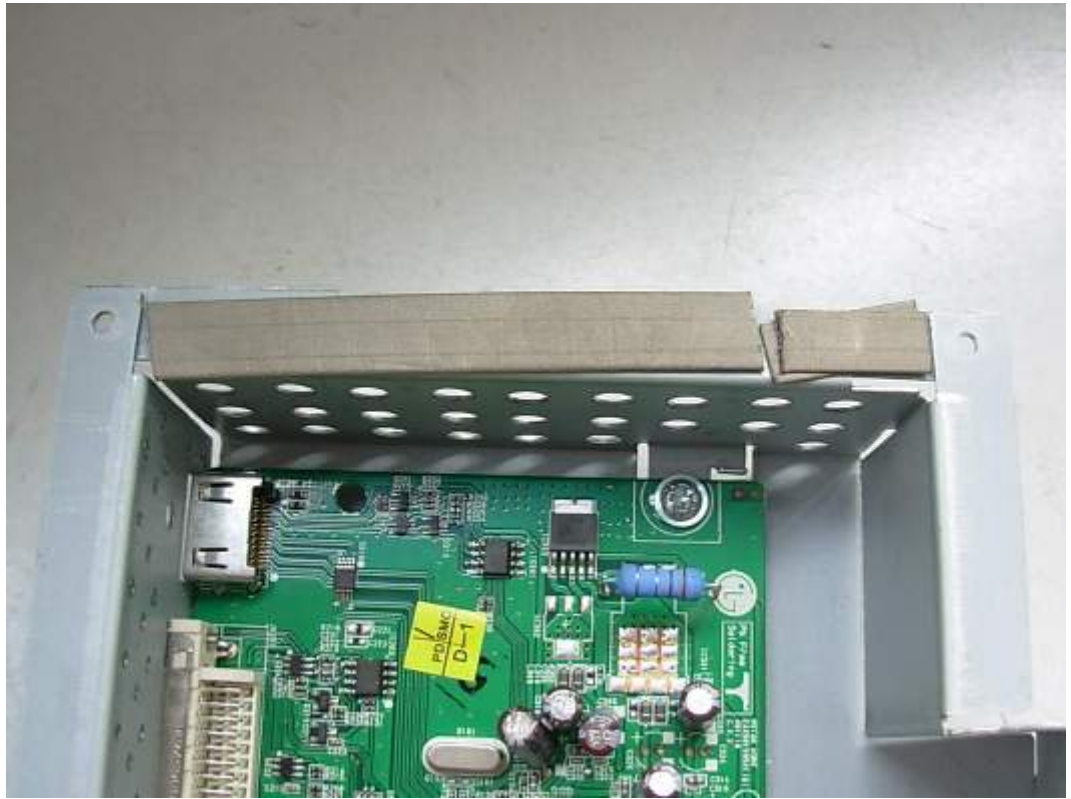
FIGURE 21 LCD MONITOR (M/N: W2361VV) DEBUG #5