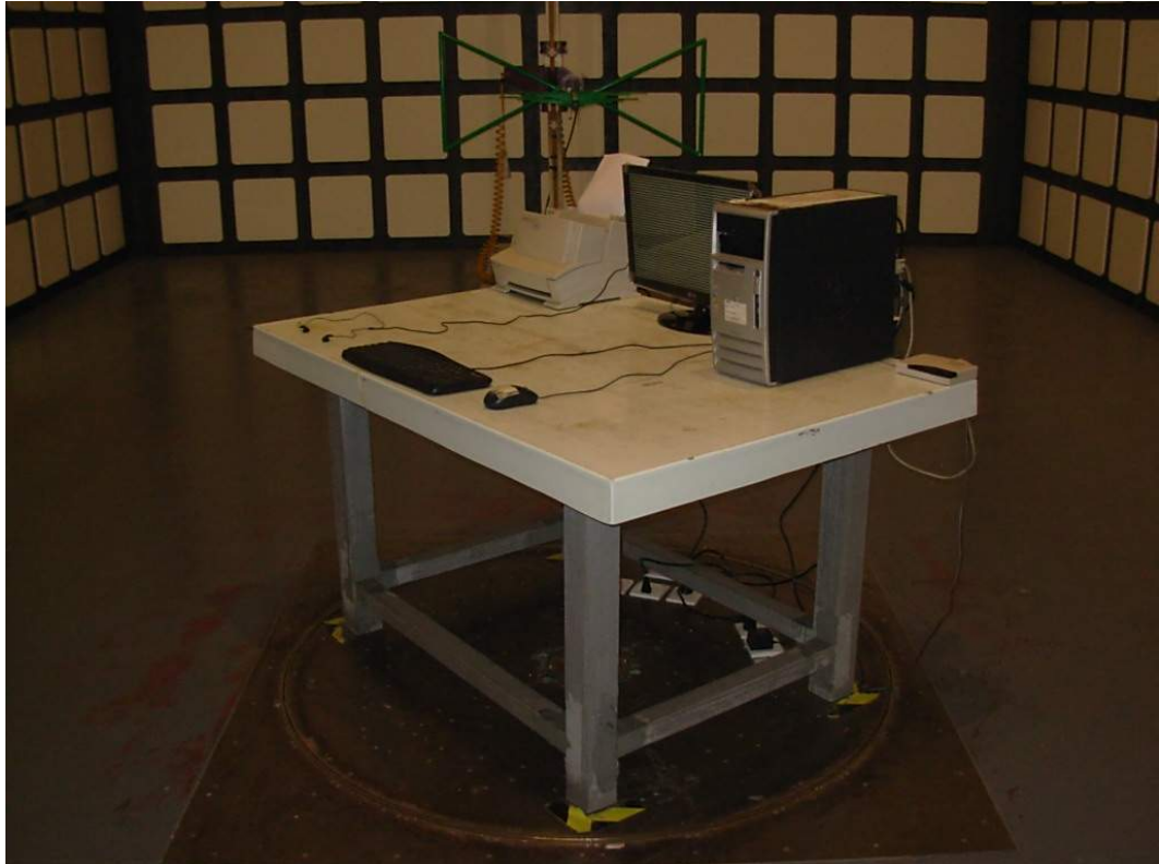
SETUP WITH MAXIMUM DETECTED EMISSION AT HORIZONTAL POLARIZATION (HDMI 1024*768@60Hz)