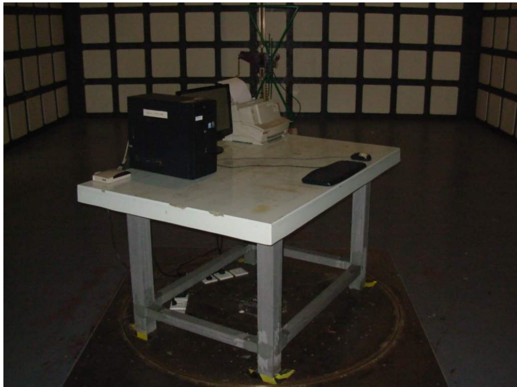
SETUP WITH MAXIMUM DETECTED EMISSION AT VERTICAL POLARIZATION (M/N: W1953TV, D-SUB 1280*1024@75Hz)