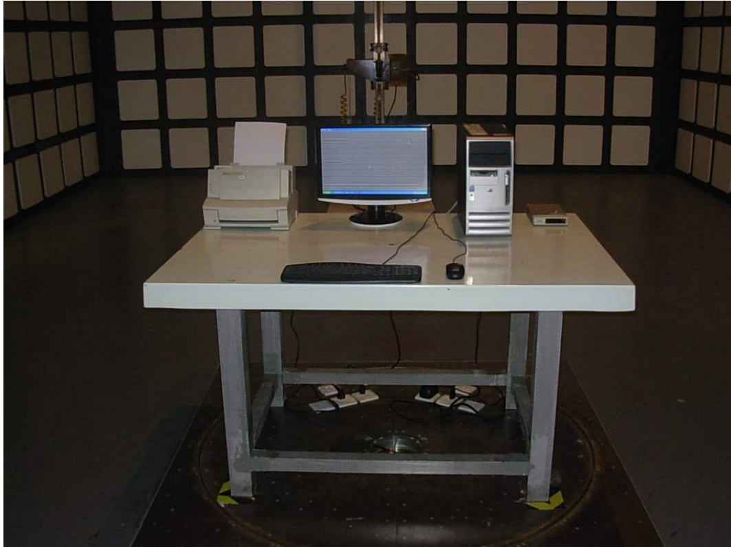
FRONT VIEW OF RADIATED EMISSION TEST (HIGH FREQUENCY)