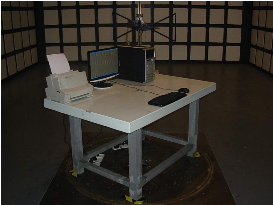
SETUP WITH MAXIMUM DETECTED EMISSION AT HORIZONTAL POLARIZATION (VGA 1440*900@60Hz, Low FREQUENCY) (M/N: W1952SQT)