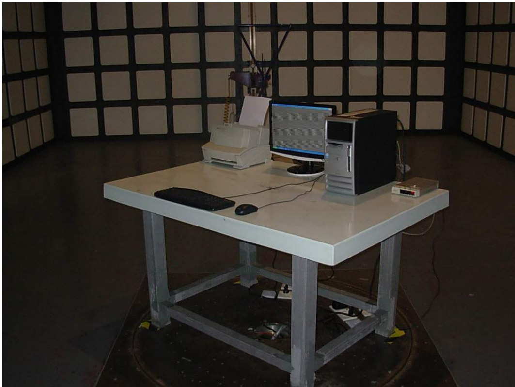
SETUP WITH MAXIMUM DETECTED EMISSION AT VERTICAL POLARIZATION (VGA 1440*900@60Hz, Low FREQUENCY) (M/N: W1952SQT)