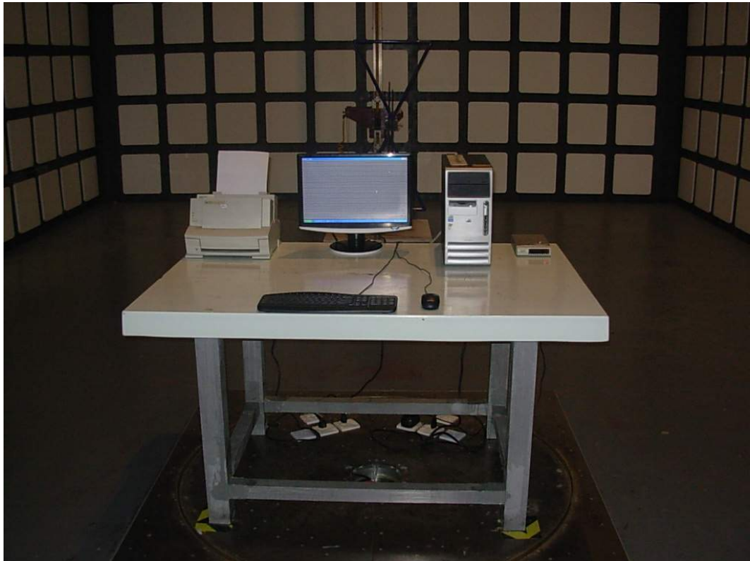
FRONT VIEW OF RADIATED EMISSION TEST (LOW FREQUENCY)