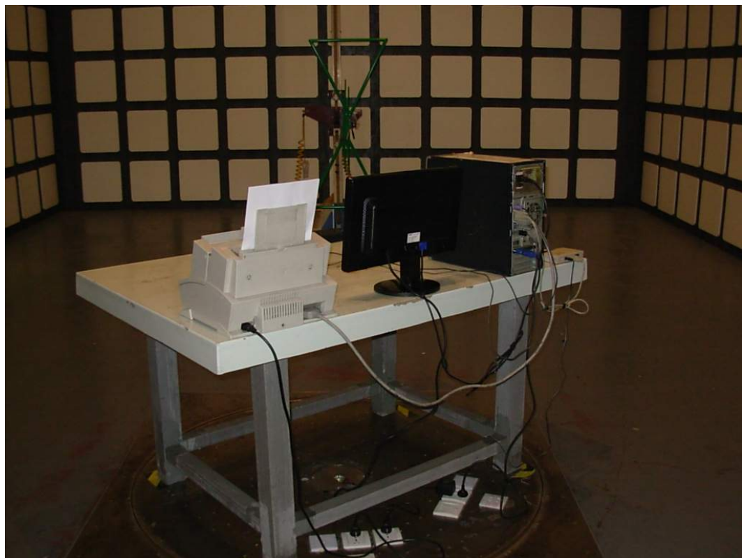
SETUP WITH MAXIMUM DETECTED EMISSION AT VERTICAL POLARIZATION (VGA 1024*768@60Hz)