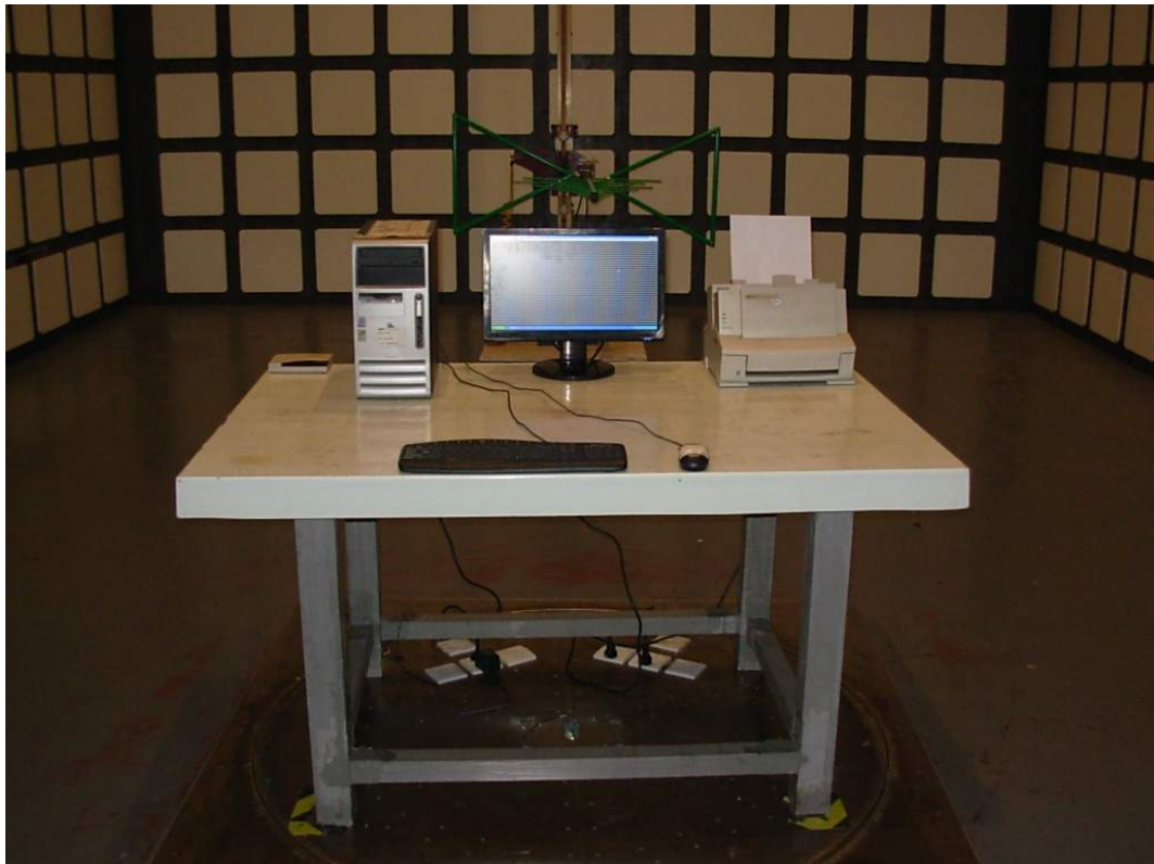
FRONT VIEW OF RADIATED EMISSION TEST