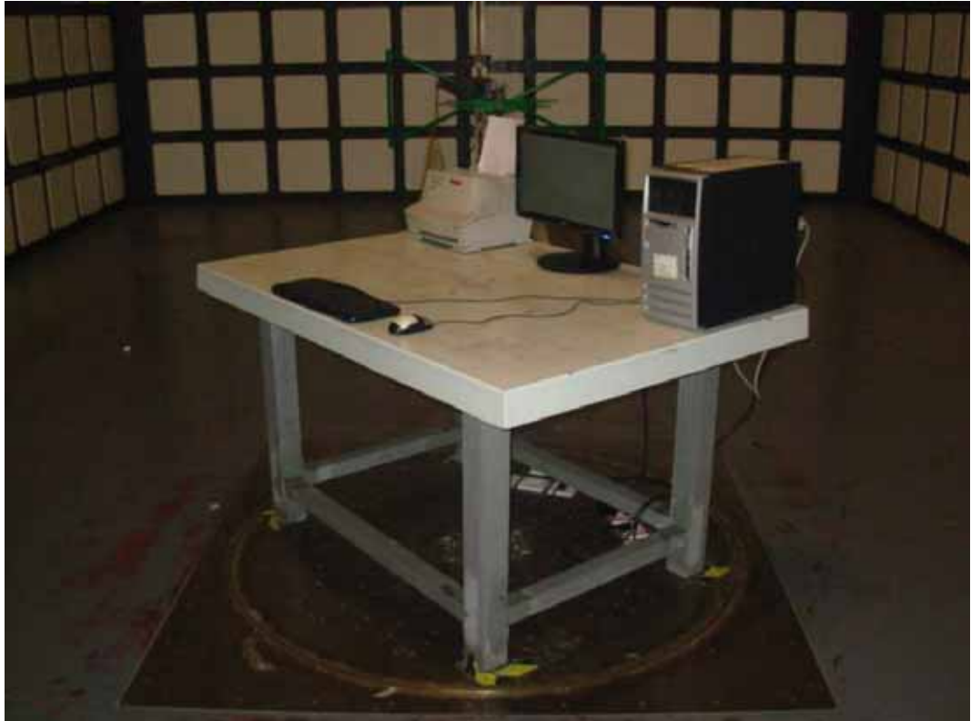
SETUP WITH MAXIMUM DETECTED EMISSION AT HORIZONTAL POLARIZATION (D-SUB 640*480@60Hz)