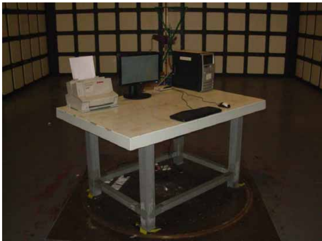
SETUP WITH MAXIMUM DETECTED EMISSION AT VERTICAL POLARIZATION (D-SUB 640*480@60Hz)