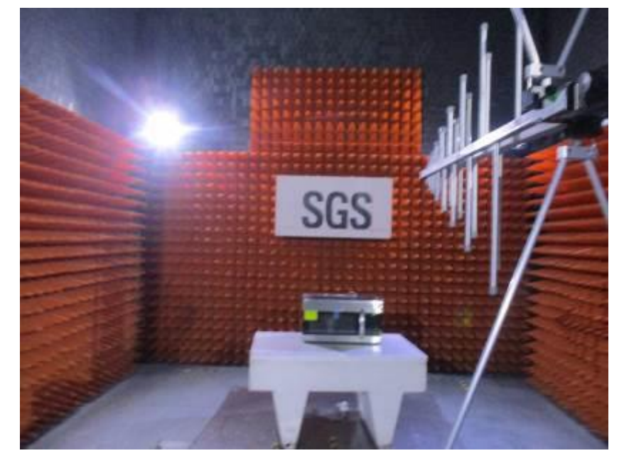
Radiated Emissions (30MHz-1GHz) Test Setup

Conducted Emissions at Mains Terminals (150kHz-30MHz) Test Setup