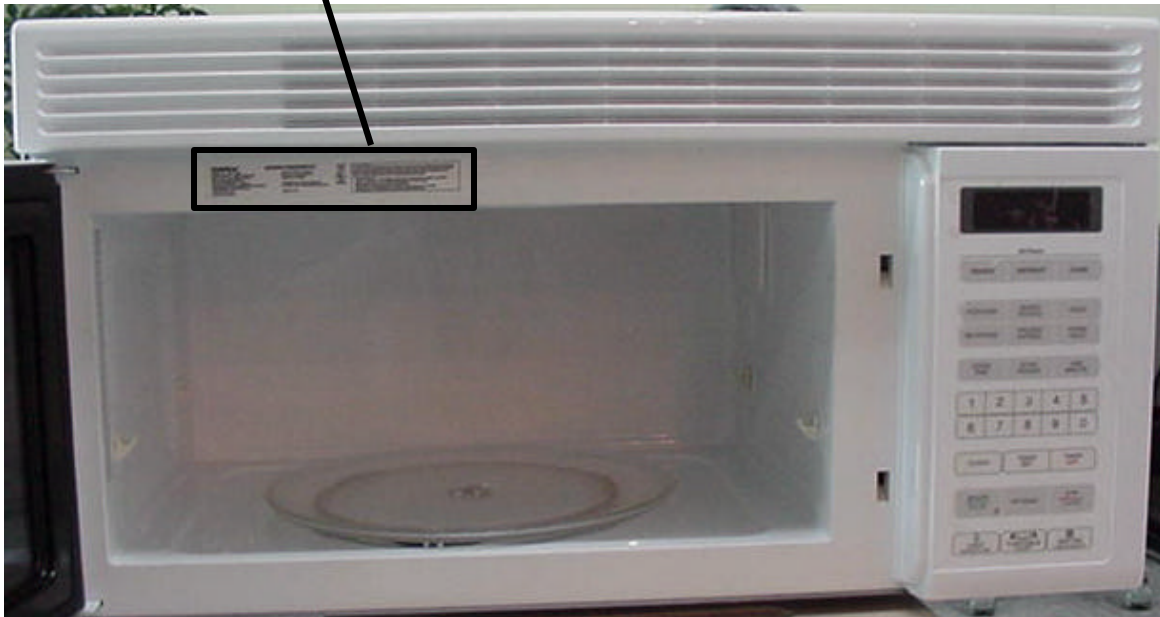
< Fig. 2. Photo of the physical location of the label >

* Alternate location: The nameplate may be alternatively affixed on the left side of control panel.