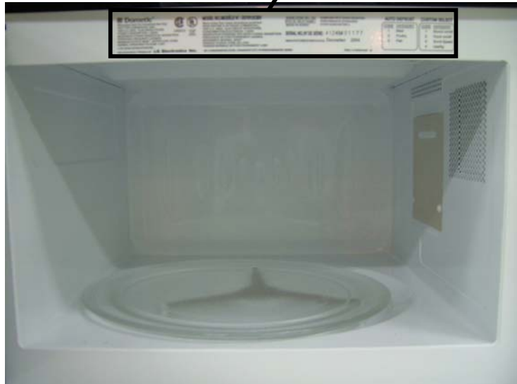
< Fig. 2. Photo of the physical location of the label>

* Alternate location: The nameplate may be alternatively affixed on the left side of control panel or internal surface of oven cavity or rear surface of oven.