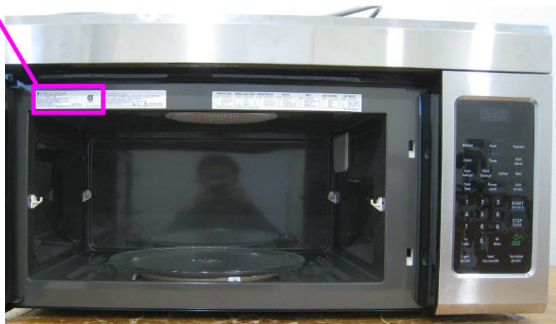
< Fig. 2. Photo of the physical location of the label>

* Alternate location: The nameplate may be alternatively affixed on the left side of control panel or internal surface of oven cavity or rear surface of oven.