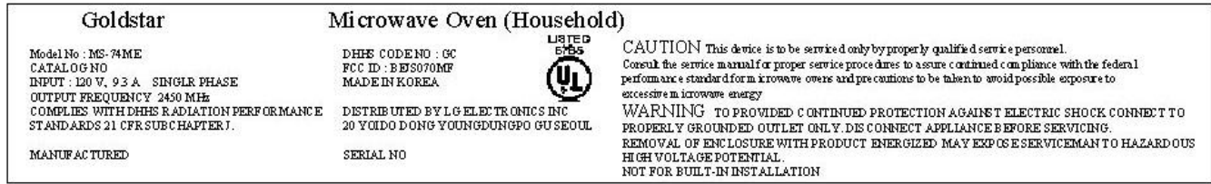
ID Label Location 1