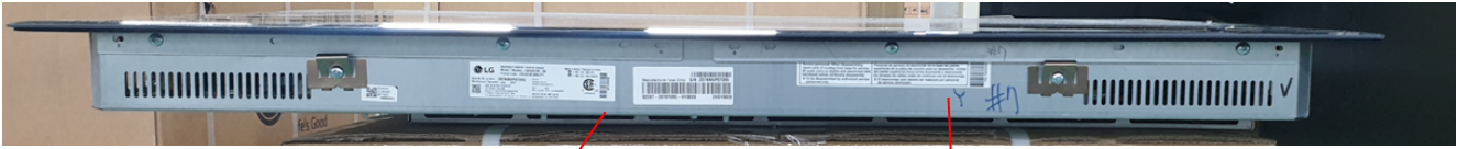
< Front side >