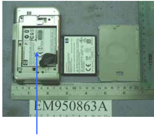
FCC Label Placement Location