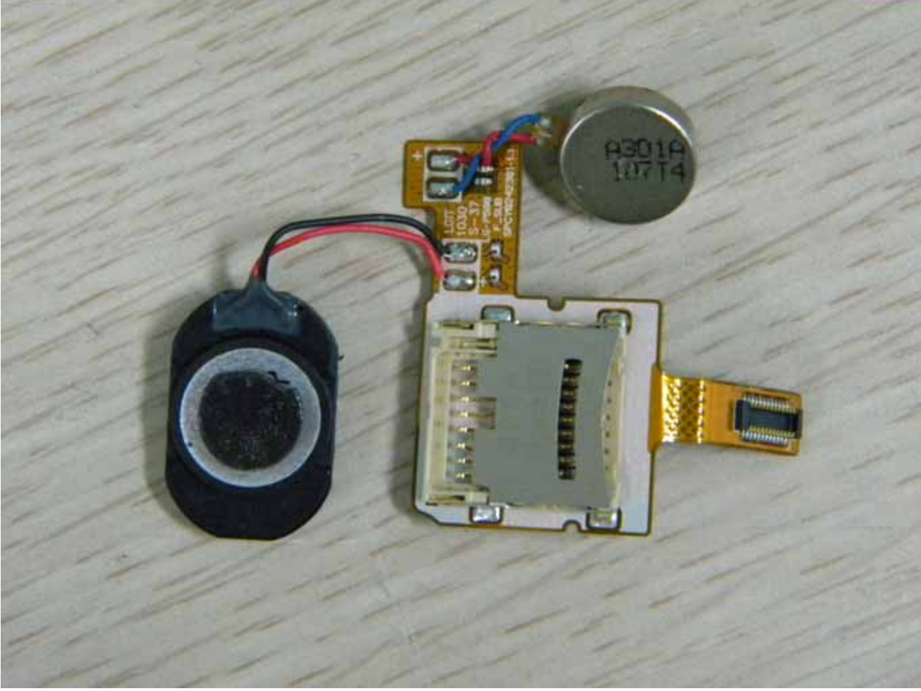
Sub board Front