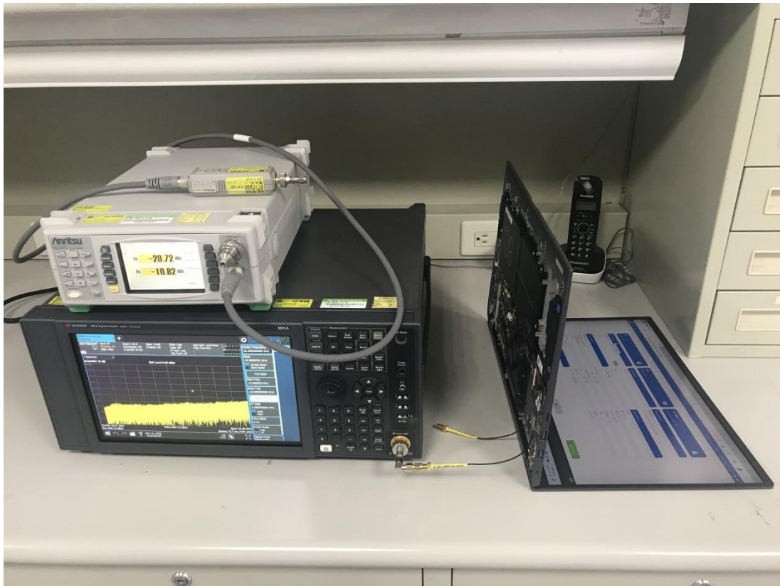
For Contention Based Protocol Test only