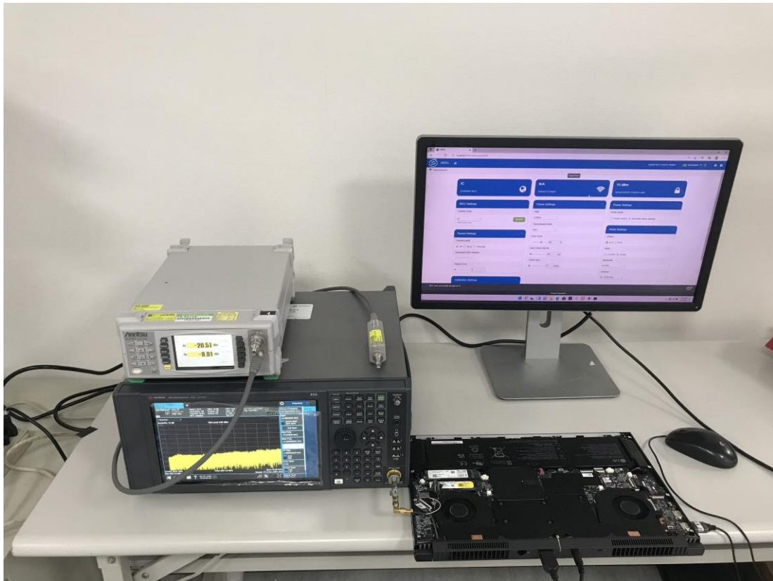
For Contention Based Protocol Test only