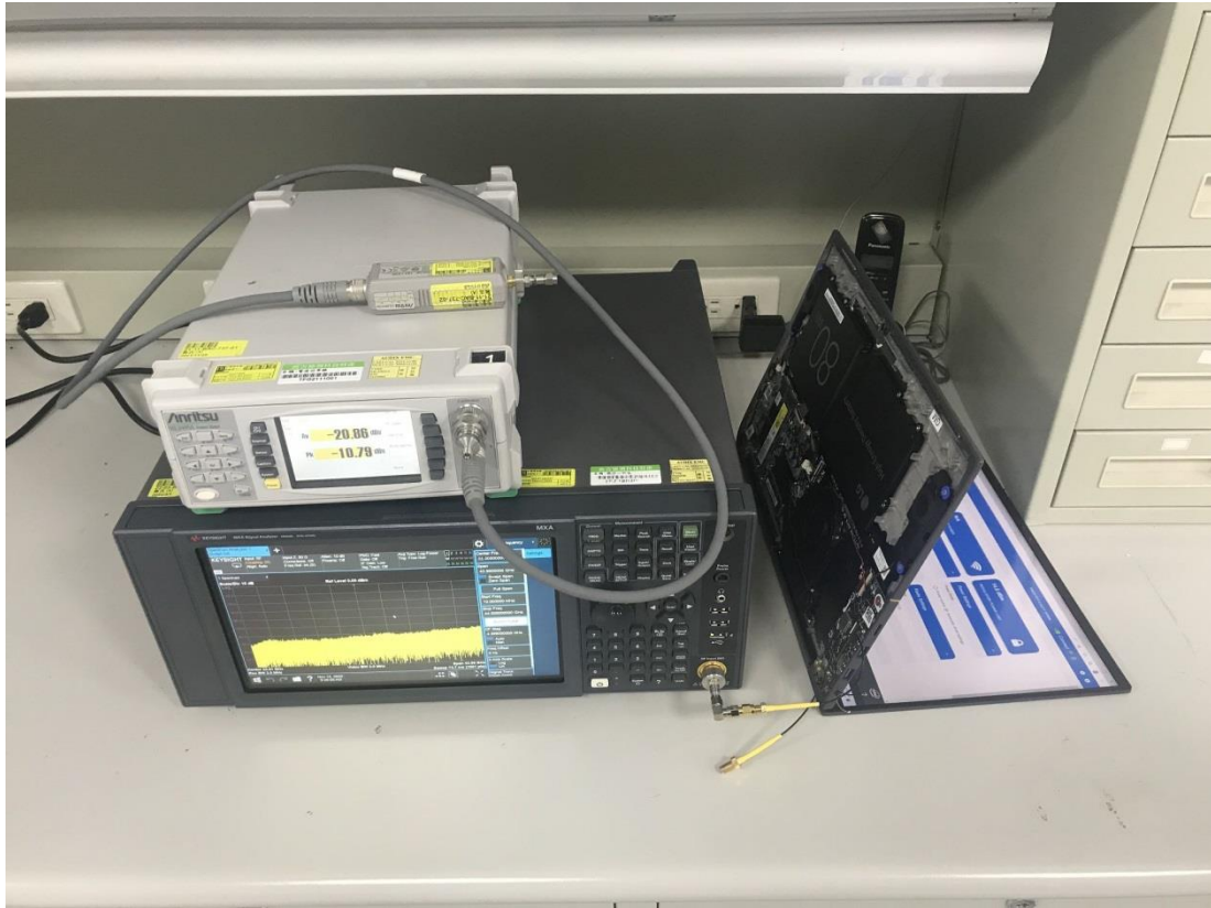
For Contention Based Protocol Test only