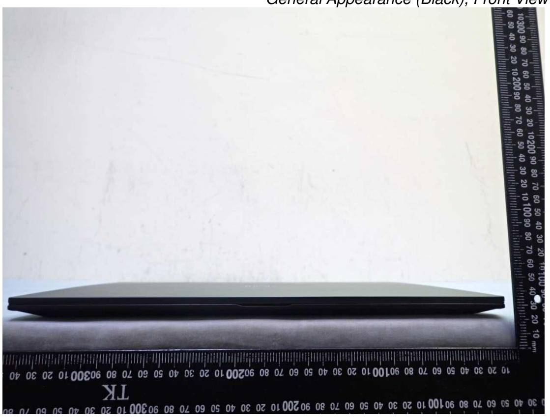
Figure 2 General Appearance (Black), Back View