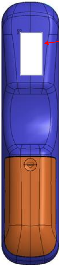
MR24GN Label position