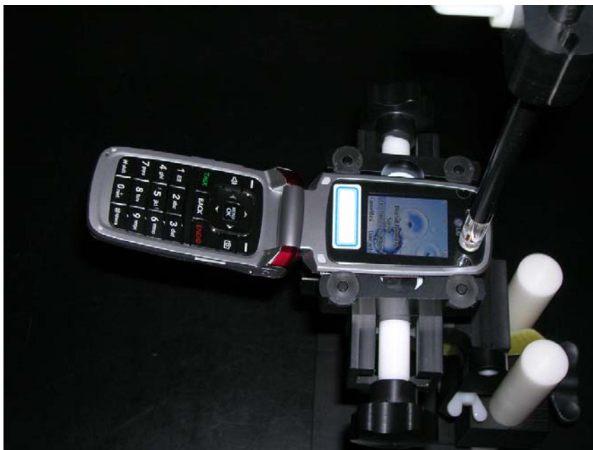
Figure 13-1 Test Setup for Wireless Device