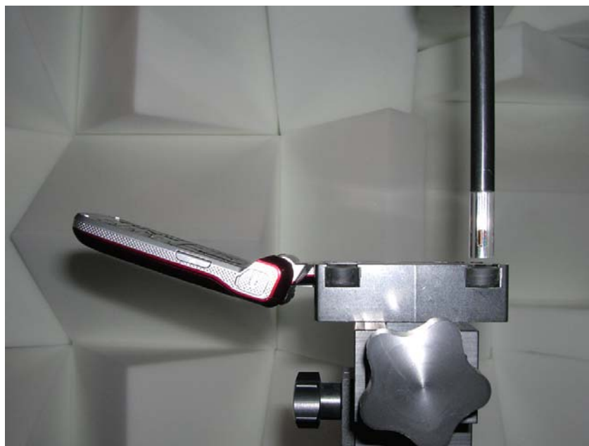
Figure 13-2 Test Setup for Wireless Device