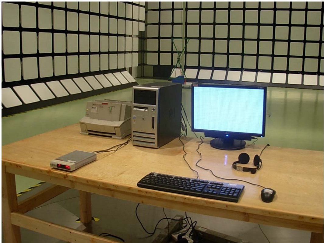
SETUP WITH MAXIMUM DETECTED EMISSION AT VERTICAL POLARIZATION (VGA 1024*768/60Hz)