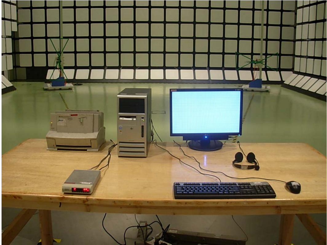
FRONT VIEW OF RADIATED EMISSION TEST (LOW FREQUENCY)