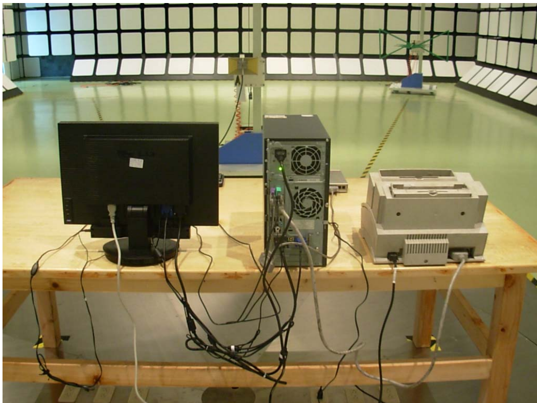
BACK VIEW OF RADIATED EMISSION TEST (HIGH FREQUENCY)