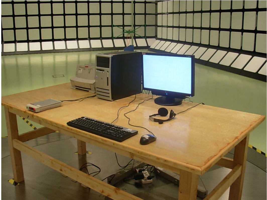
SETUP WITH MAXIMUM DETECTED EMISSION AT HORIZONTAL POLARIZATION (VGA 1024*768/60Hz)