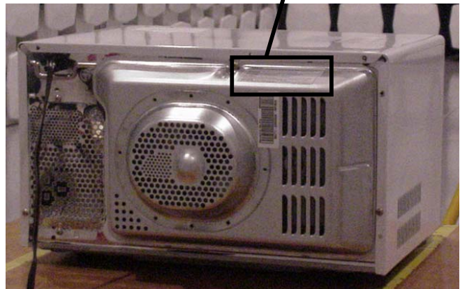
< Fig. 2. Photo of the physical location of the label>

* Alternate location: The nameplate may be alternatively affixed on the left side of control panel or internal surface of oven cavity or rear surface of oven.