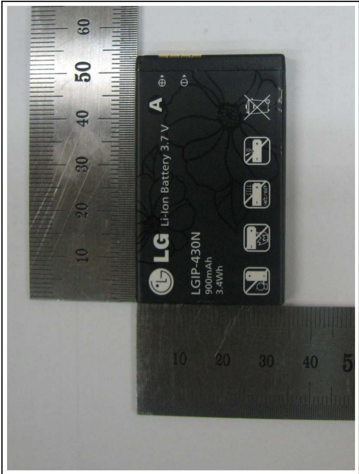
Figure 10 DUT Photo