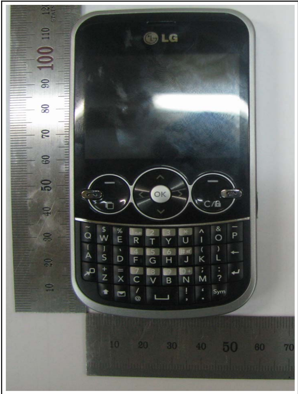
Figure 7 DUT Photo