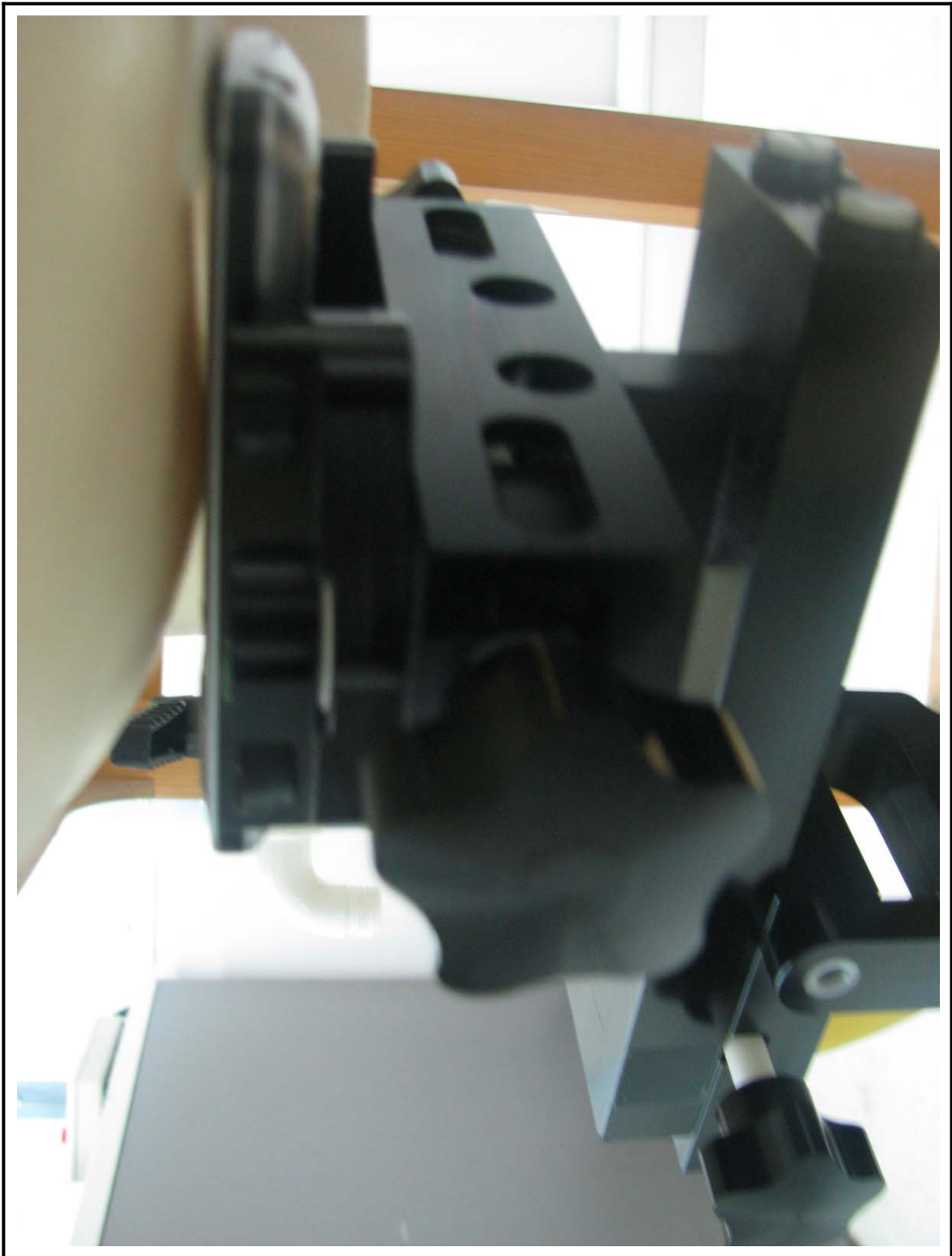
Figure 3 Left Head SAR Test Setup – Cheek Touch Position