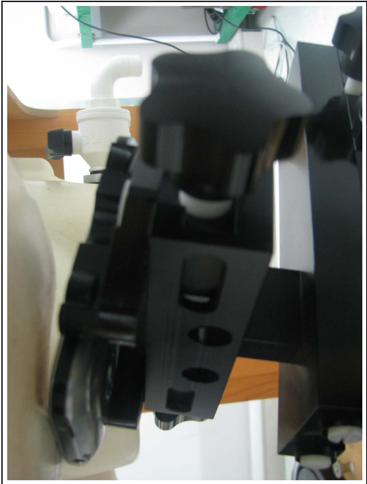
Figure 2 Right Head SAR Test Setup - Ear Tilt Position