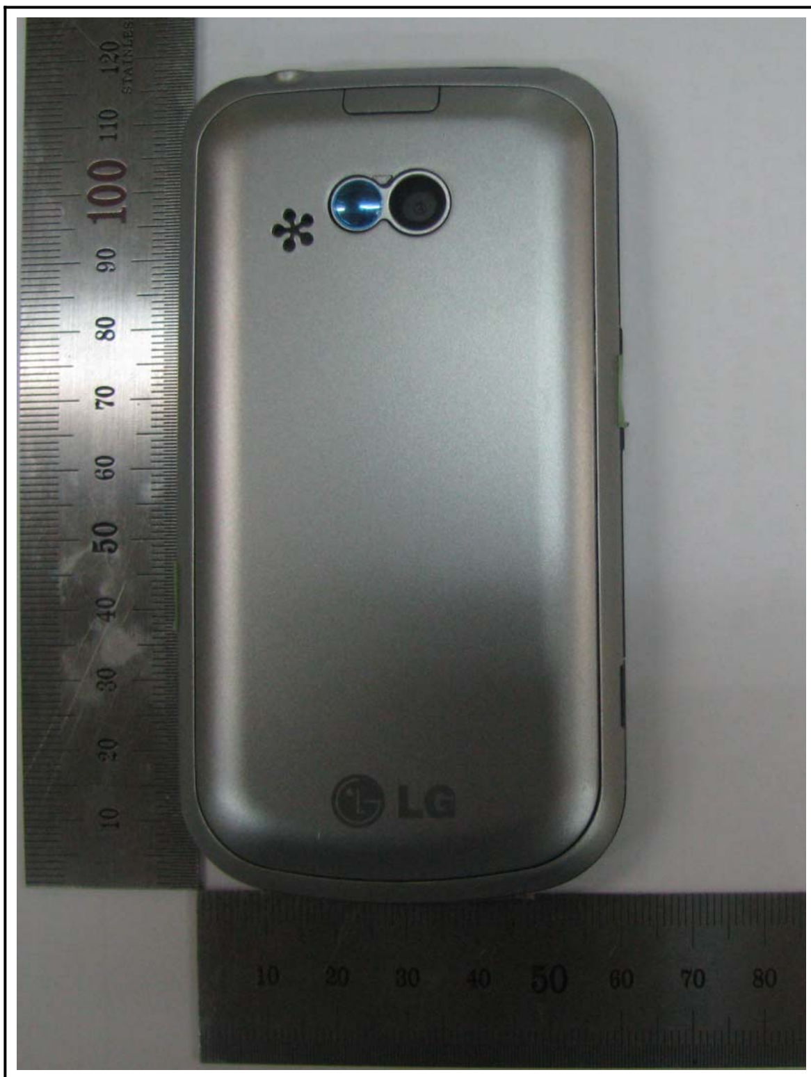
Figure 9 DUT Photo