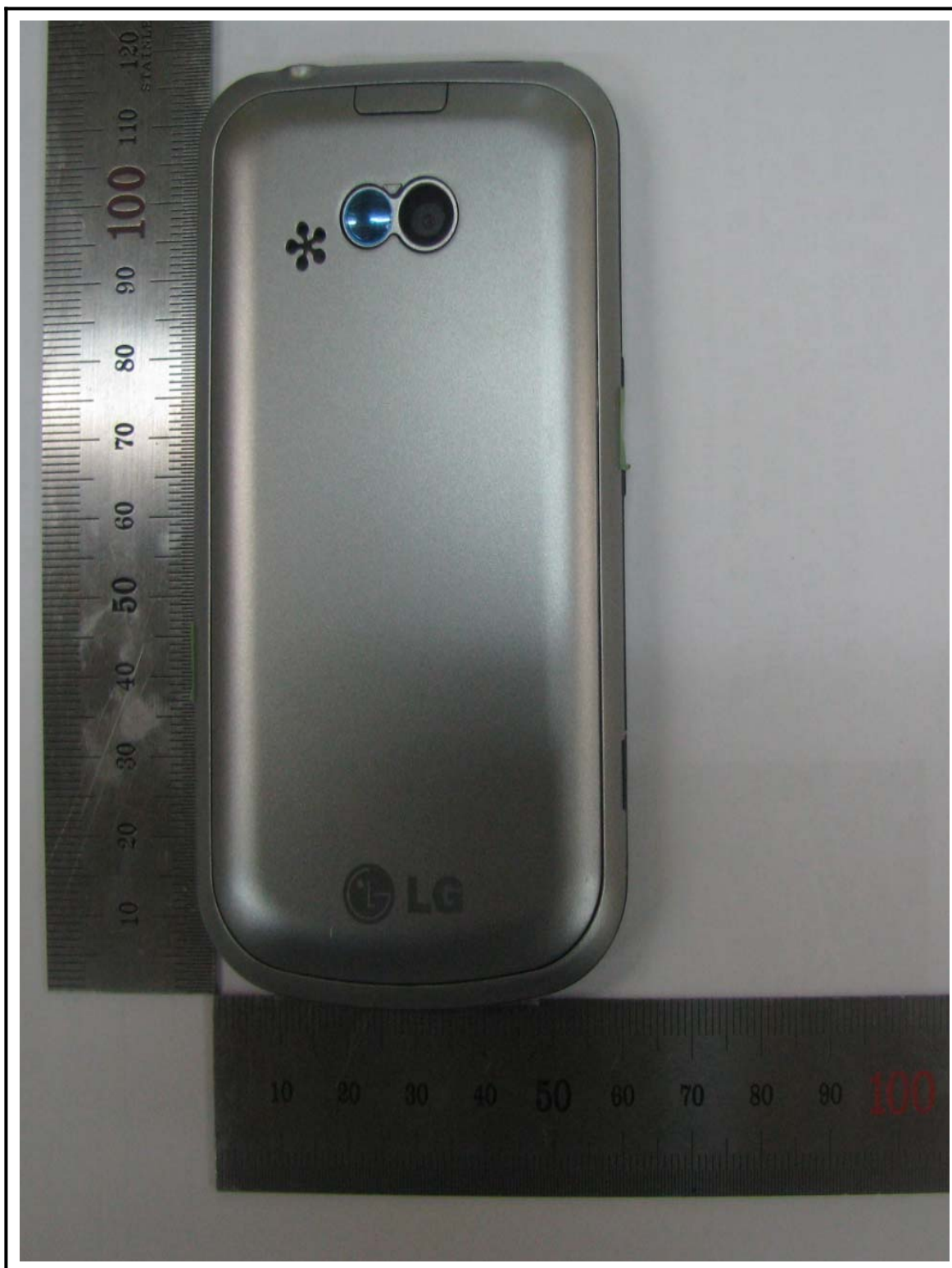
Figure 8 DUT Photo