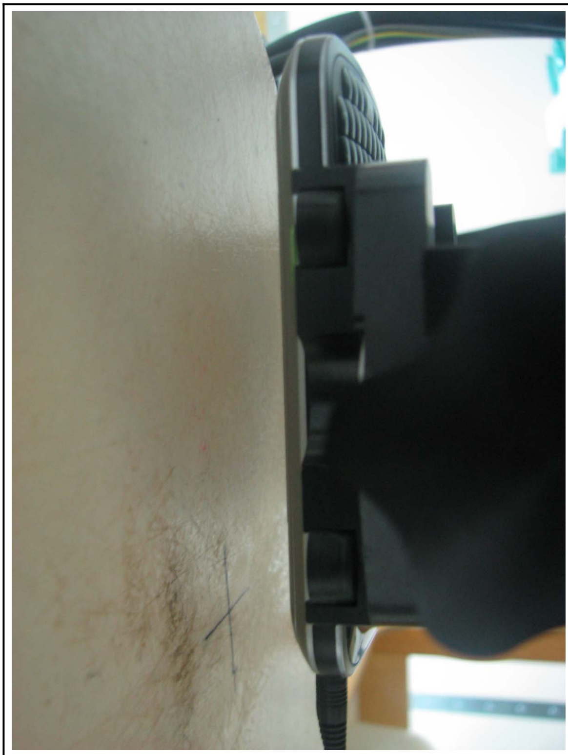
Figure 6 Body SAR Test Setup – w/o Holster