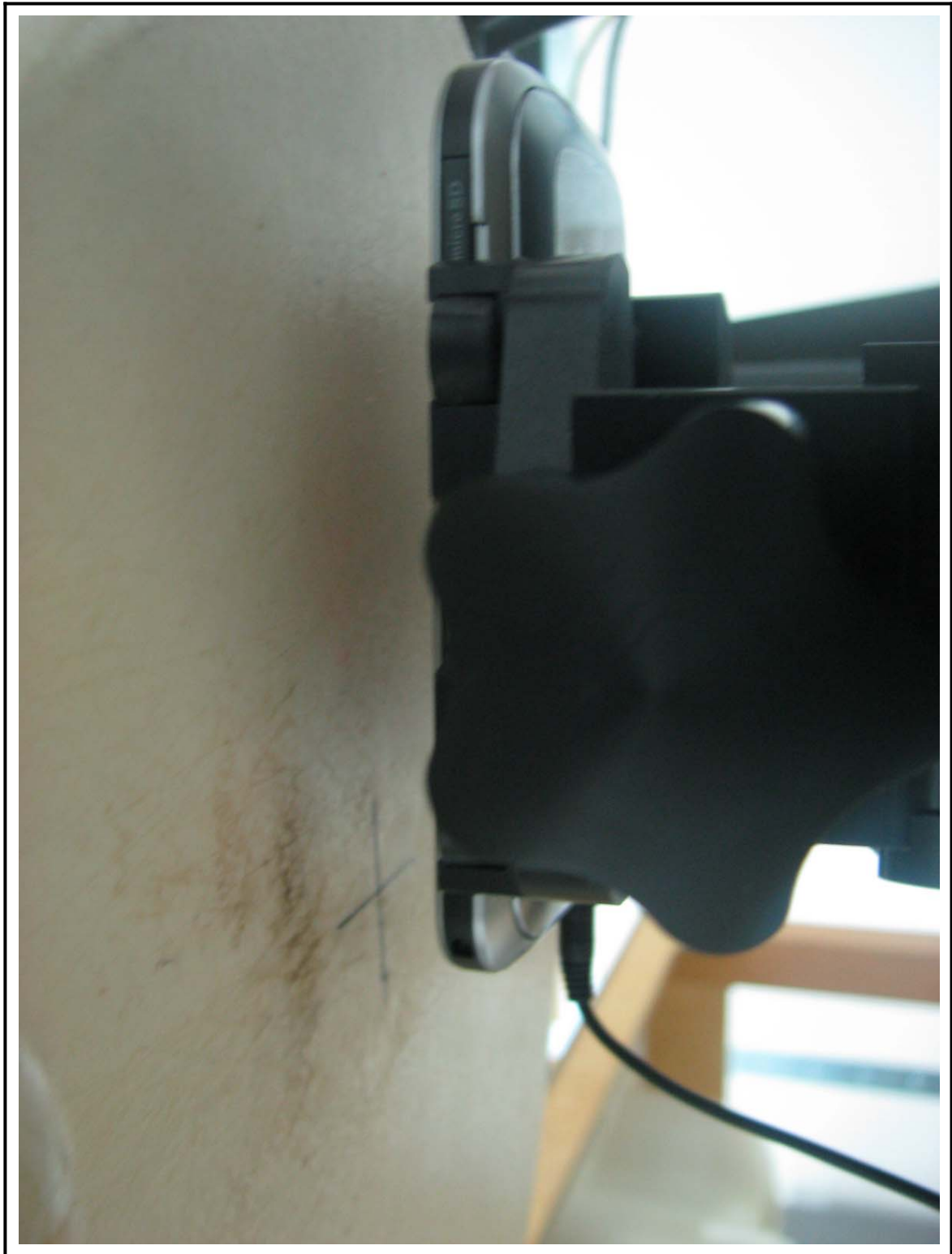
Figure 5 Body SAR Test Setup – w/o Holster