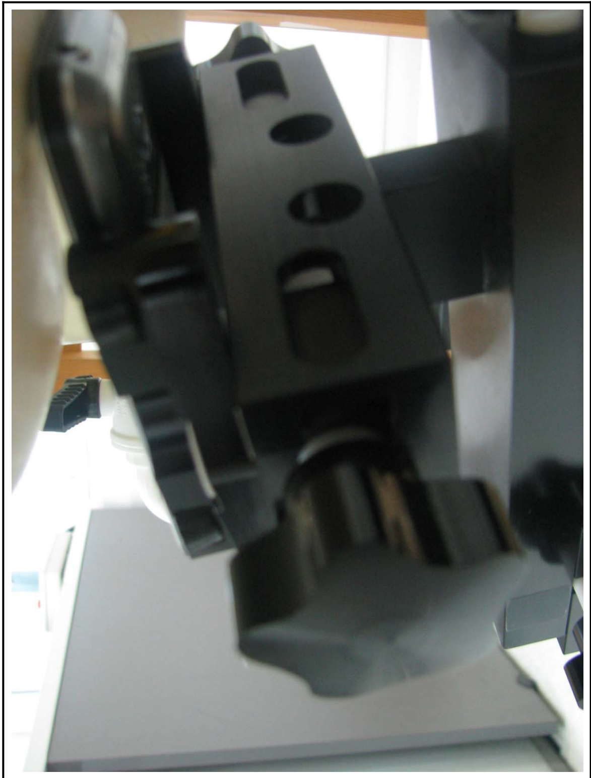
Figure 4 Left Head SAR Test Setup - Ear Tilt Position